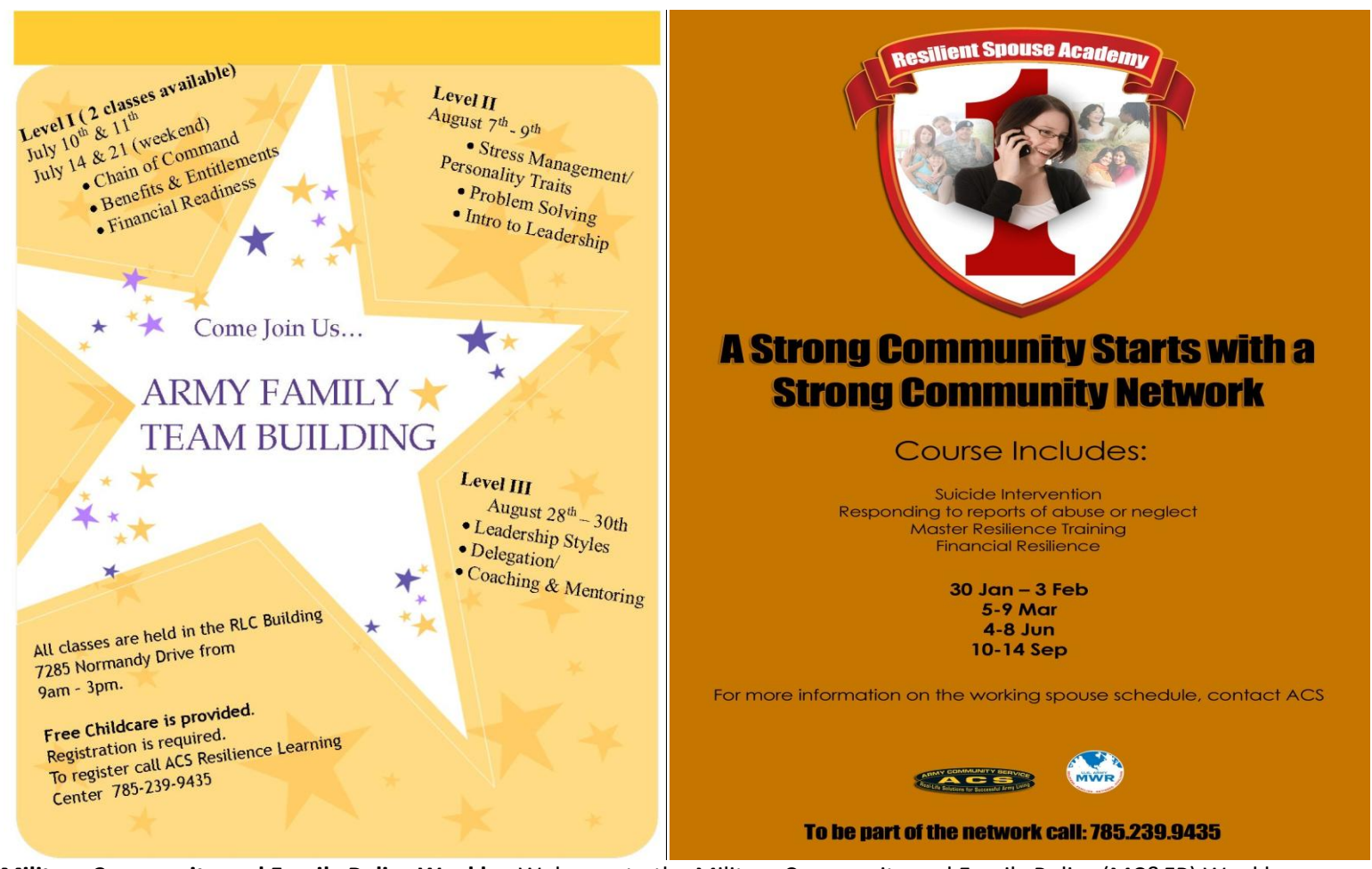
Military Community and Family Policy Weekly: Welcome to the Military Community and Family Policy (MC&FP) Weekly

ACS hosts Army Family Team Building classes: Family members new to military life or who want to know more about the opportunities available to them on post can participate in the Army Family Team Building...see attached flyer. Also attached is the flyer for the September Resilient Spouse Academy- great class to take!