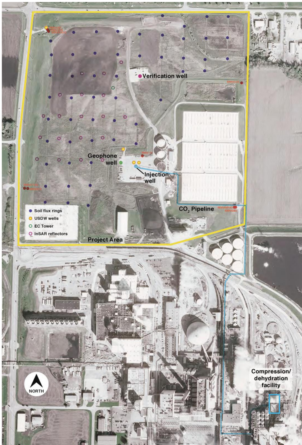
Figure 1. Overview of the Illinois Basin – Decatur Project during drilling of the verification well in November 2010.