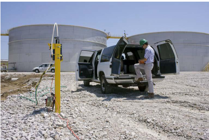
Figure 4. Groundwater sampling efforts at the ADM site.