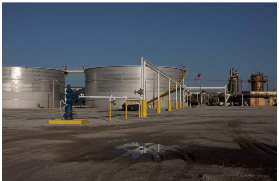
Figure 3. Completed CO 2 pipeline at the ADM site.