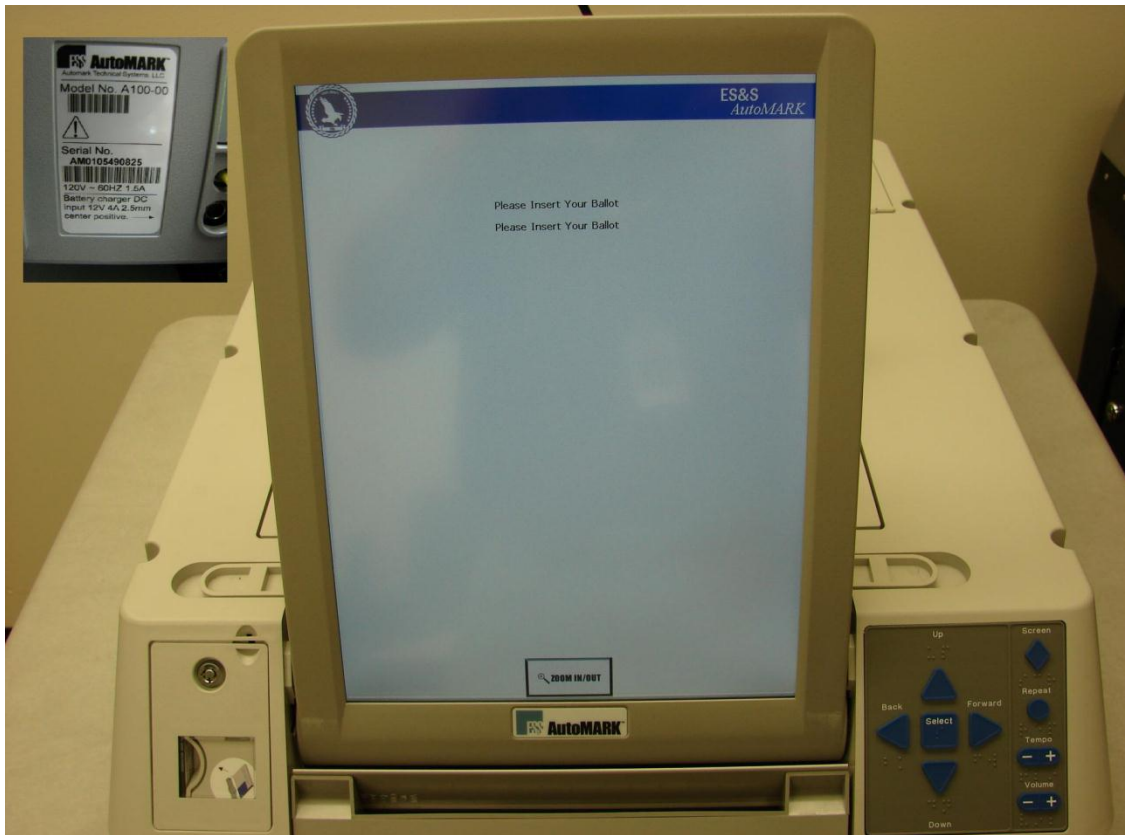
Photograph 7: AutoMARK A100 VAT