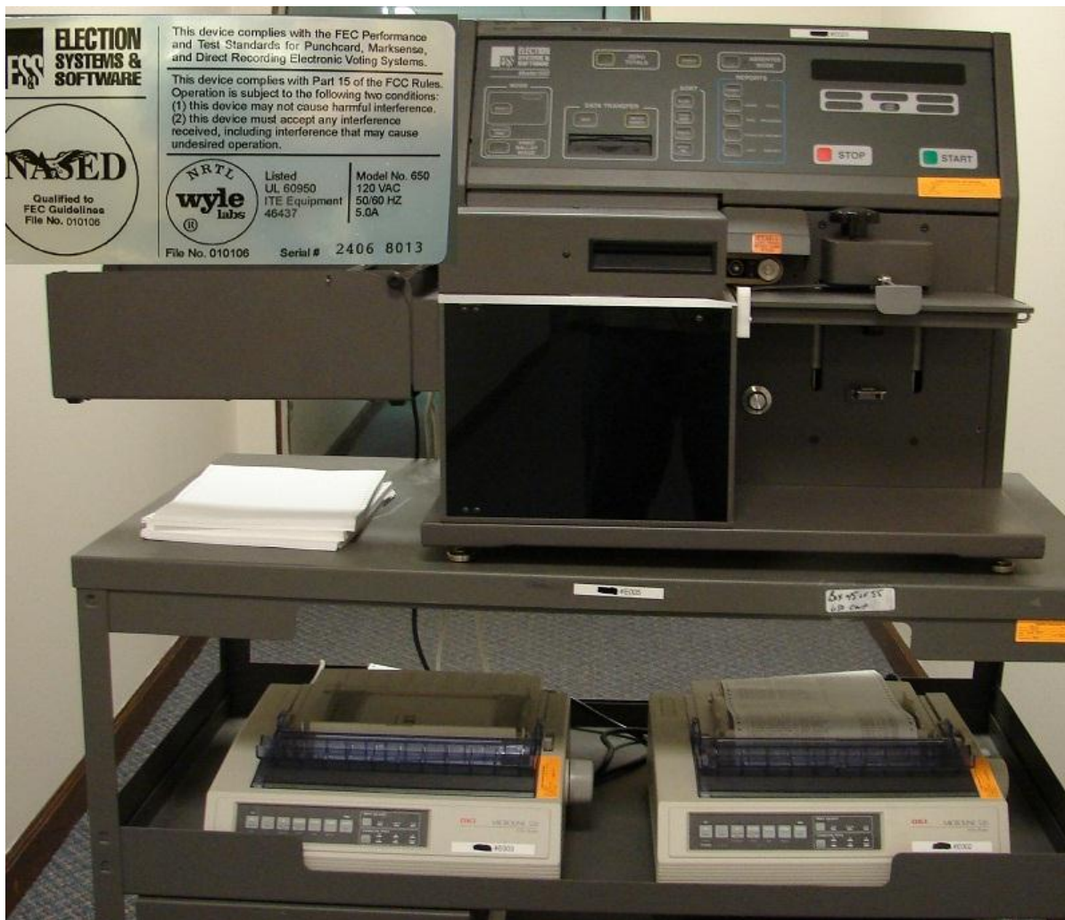
Photograph 5: M650

The Model 650 is a high-speed, optical scan central ballot counter. During scanning, the Model 650 prints a continuous audit log to a dedicated audit log printer and can print results directly from the scanner to a second connected printer. The scanner saves results to a Zip disk that officials can use to generate results reports from a PC running Election Reporting Manager. The Model 650 sorts write-in ballots, blank ballots, overvoted ballots and illegal ballots.