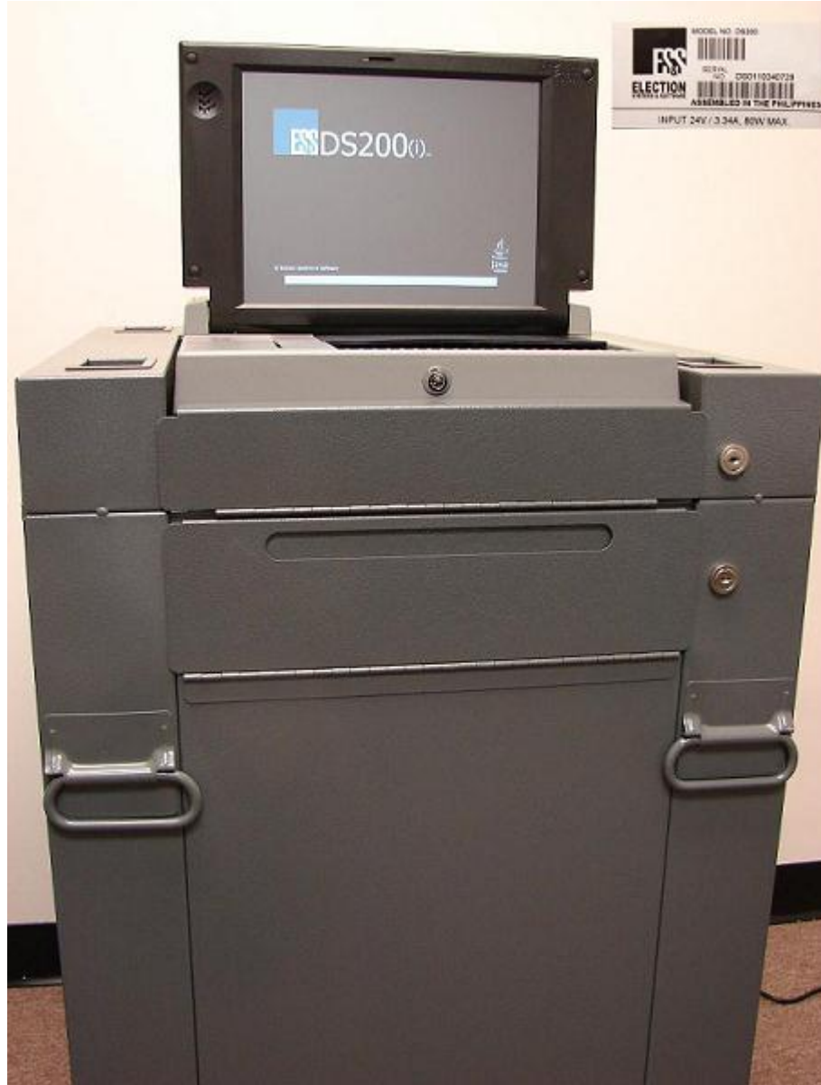
Photograph 3: DS200 (on metal ballot box)