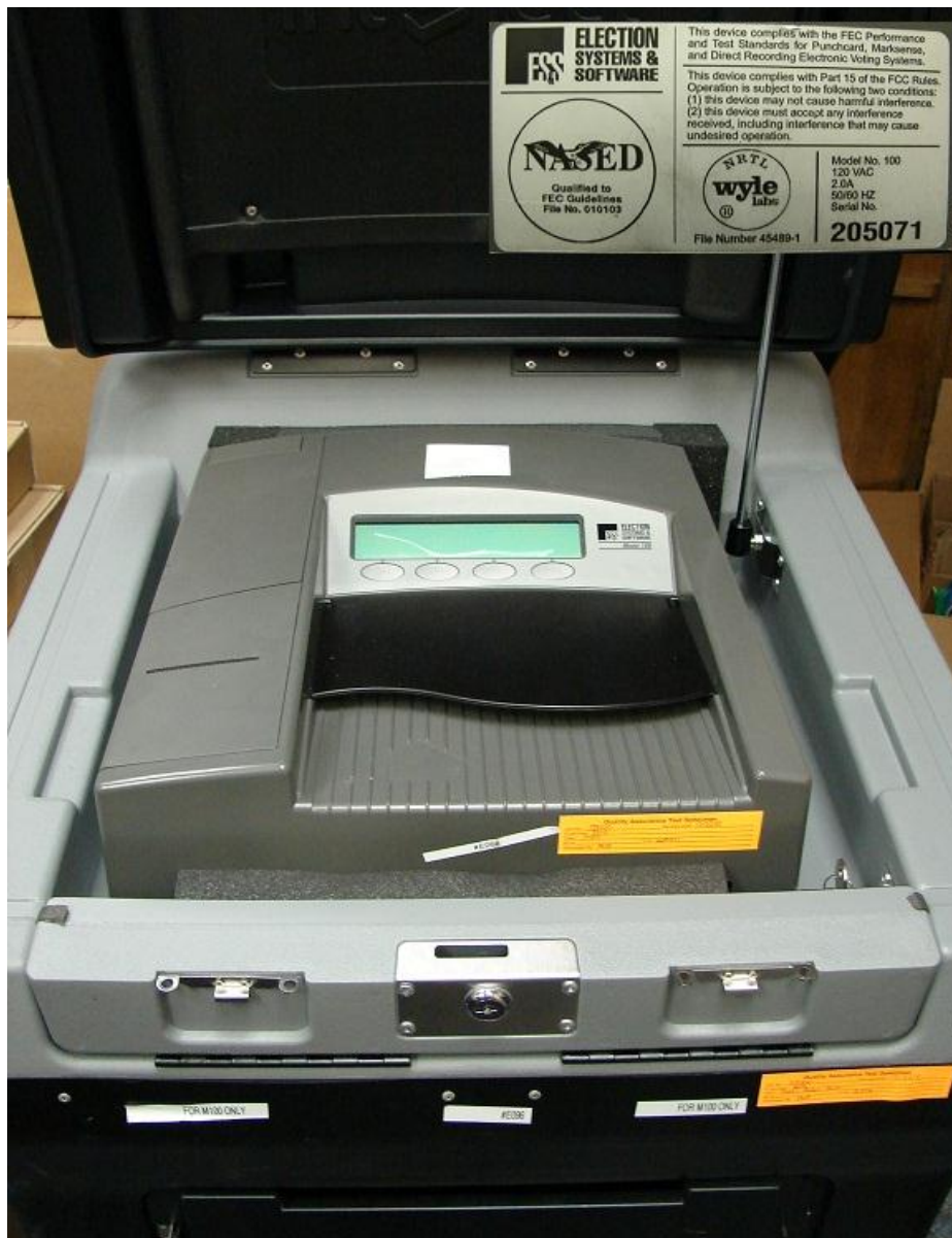
Photograph 1: Model 100 (on plastic ballot box)

The Model 100 is a precinct-based, voter-activated paper ballot tabulator that uses advanced Intelligent Mark Recognition (IMR) visible light scanning technology to detect completed ballot targets. The Model 100 is designed to alert voters to overvoted races, undervoted races, and blank ballots. It accepts ballots inserted in any orientation. Once the ballot is scanned by the Model 100, it is passed to the integrated ballot box.