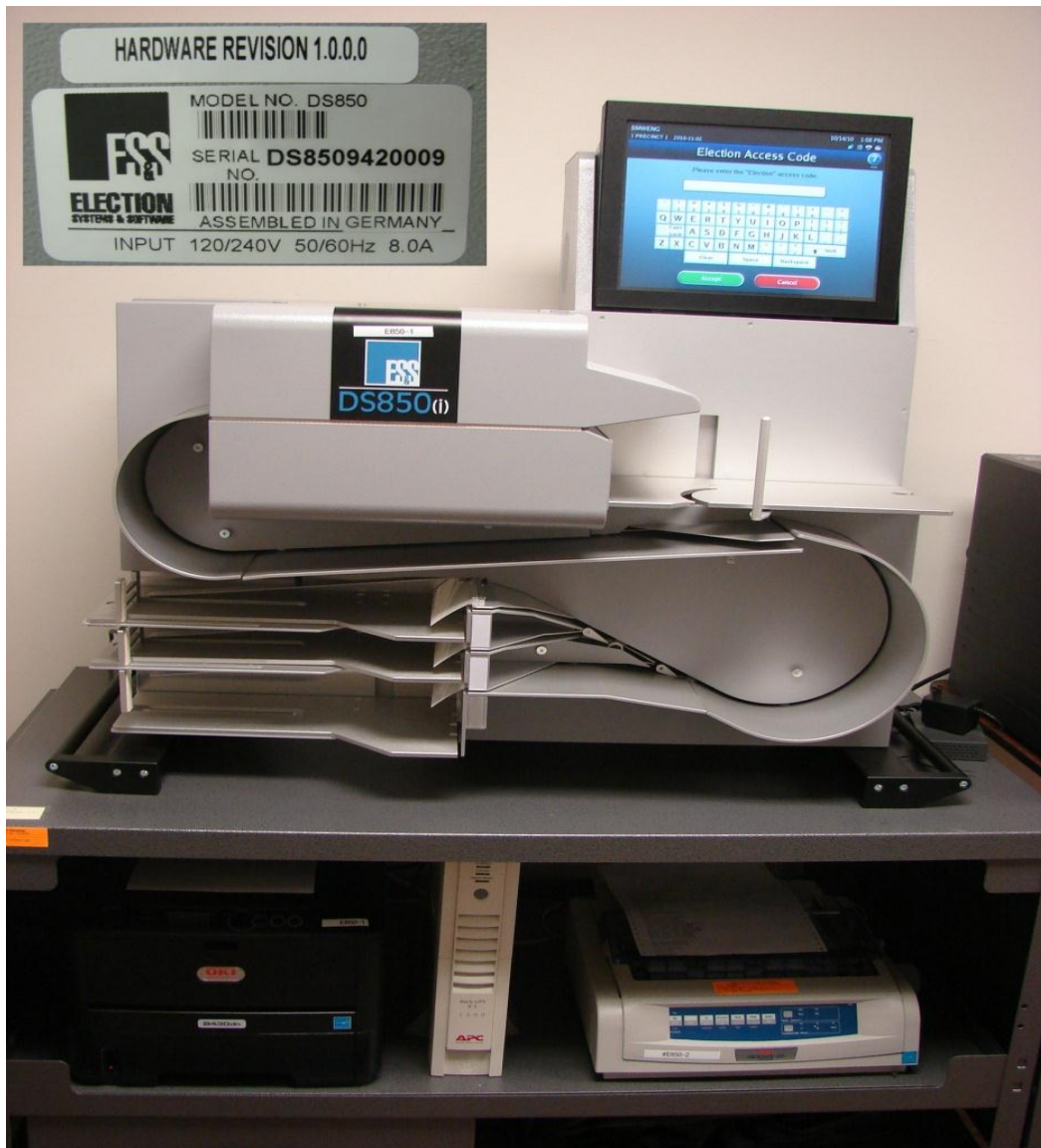
Photograph 4: DS850

The DS850 is a high-speed, optical scan central ballot counter. During scanning, the DS850 prints a continuous audit log to a dedicated audit log printer and can print results directly from the scanner to a second connected printer. The scanner saves results internally and to results collection media that officials can use to format and print results from a PC running Election Reporting Manager. The DS850 has an optimum throughput rate of nearly 400 ballots per minute and uses advanced cameras and imaging algorithms to image the front and back of a ballot, evaluate the results and sort ballots into discrete bins to maintain continuous scanning within fractions of a second.