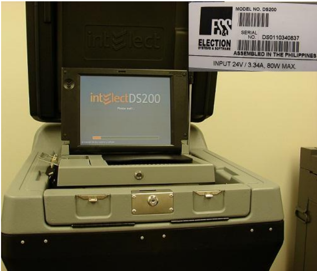
Photograph 2: DS200 (on plastic ballot box)

The system includes a 12-inch touch screen display providing clear voter feedback and poll worker messaging. Once a ballot is tabulated and the system updates internal vote counters, the ballot is dropped into an integrated, secure ballot box. The DS200 includes an internal thermal printer for the printing of zero reports, log reports, and polling place totals upon the official closing of the polls.