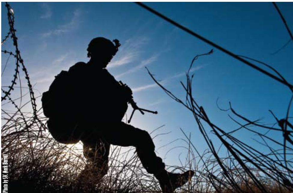
In harm's way —An Army soldier patrols in Afghanistan in March 2011. Researchers are exploring how to distinguish between overlapping symptoms of PTSD and traumatic brain injury.