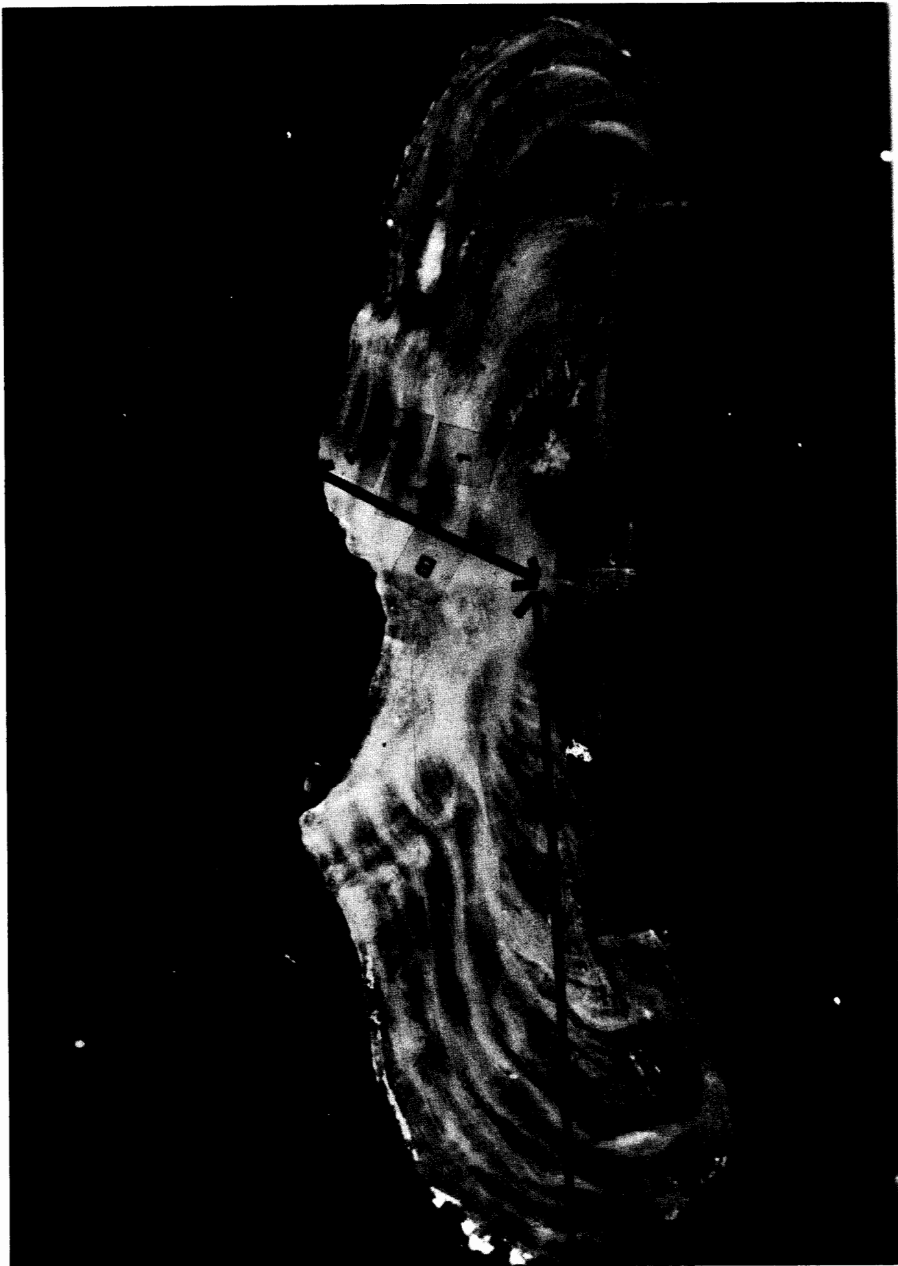
Figure 1. A cross-section of an otolith from a 623 mm TL female southern flounder showing the length-wise (A) measurement and the width-wise (B) measurement. Four + marks are indicated. (Photographed with reflected light.)