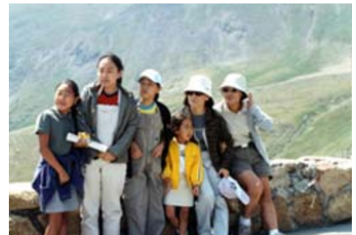
Visitors to Rocky Mountain National Park

The plan is compatible with a number of other efforts including the National Diversity Recruiting Plan and the Department of Interior (DOI) and NPS Human Capital Plans, as well as the efforts of the Recruitment Futures Workgroup.