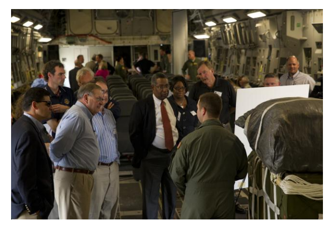
Receiving a briefing from an aircrew member during a tour of a C-17 Globemaster III.