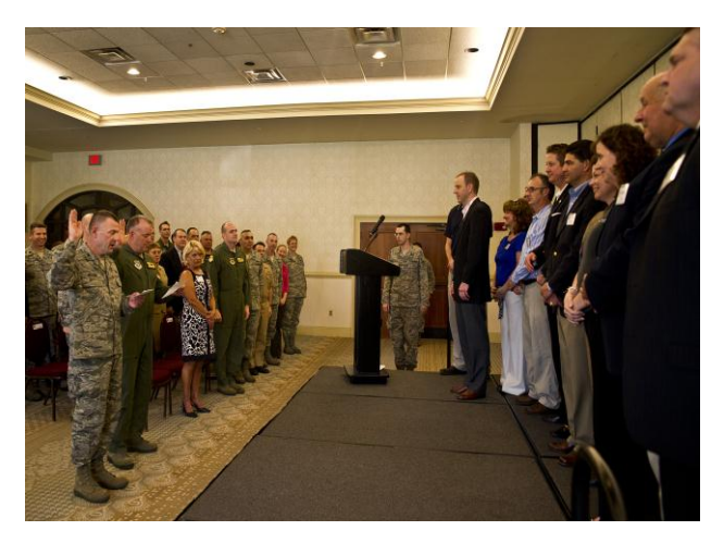
Taking the oath of office - Congratulations Team Charleston 2012 Honorary Commanders