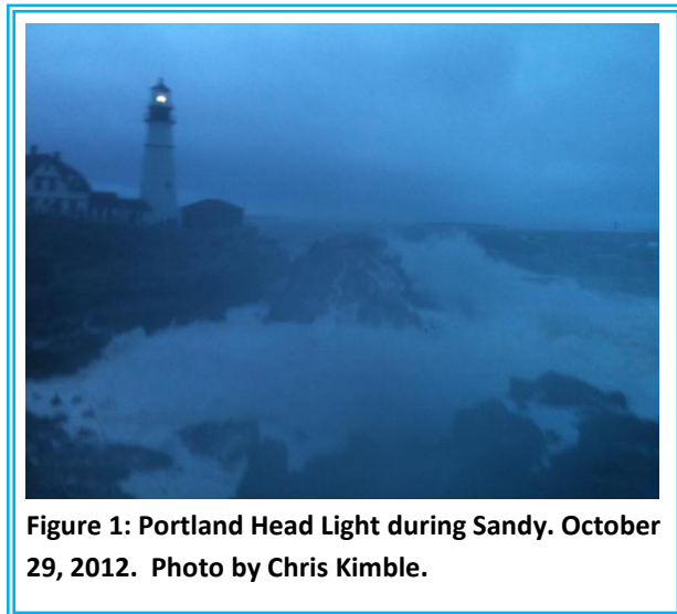
Figure 1: Portland Head Light during Sandy. October 29, 2012.

Sandy took a hard left turn and plowed into Southern New Jersey with a storm track that was nearly perpendicular to the coastline, the worst case scenario for that area. There were two key factors that caused Sandy to take that unusual left turn instead of heading out to sea. The first feature was a strong blocking ridge of high pressure