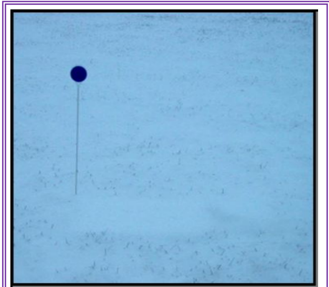
Figure 3: Placing a flag or other marker near your snowboard will make it easier to find once the landscape becomes blanketed in white!

If it is very windy and the reading on the snow board does not seem representative of what actually fell, it will then be necessary to take several measurements around the area and average these to come up with a more representative snowfall reading. The important thing to remember is to use your best judgment.