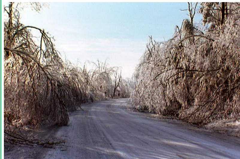
Figure 4: Ice storms can cause severe damage to trees and structures, as well as make roads very slippery. This photo was taken by John Jensenius during the 1998 ice storm.

Many of us look forward to winter and the variety of outdoor winter activities that the season brings. However, winter also brings hazardous driving conditions, dangerously cold temperatures and wind chills, and the possibility of extended power outages due to ice and heavy wet snow. As we look ahead toward the winter season, we should make sure we are prepared for the upcoming season.