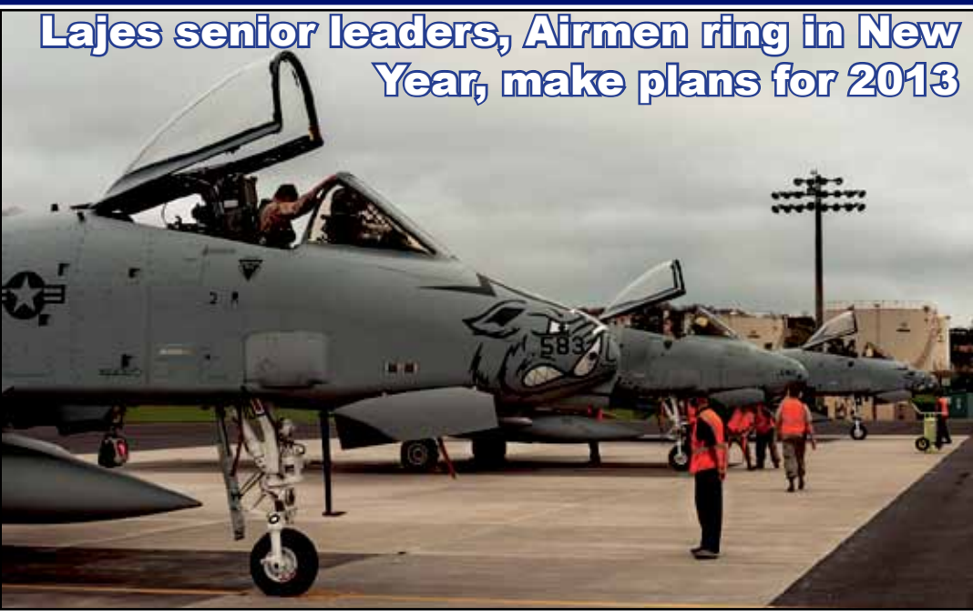
65th Operations Support Squadron Airmen work with A-10 Thunderbolt pilots and crews during a fighter movement through Lajes Field. Lajes Field Airmen are back to work after the holiday season and have their sights set on high performance and continued excellence in 2013.