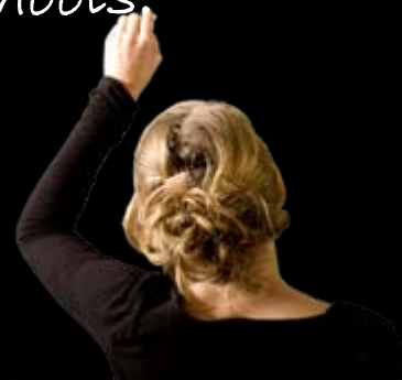
Peter Cohen CEO, Curriculum Pearson

Broadband and persistent access to the web is a must if we are to transform education . If schools are to embrace rich media content and innovate to allow students to learn anywhere, anytime , they must provide for enough bandwidth to support video, audio and live instruction online. To allow for this with multiple concurrent users, they must have broadband access. We support the educational value of having persistent high bandwidth internet access to improve educational outcomes and leverage the advantages of web delivered programs into schools.