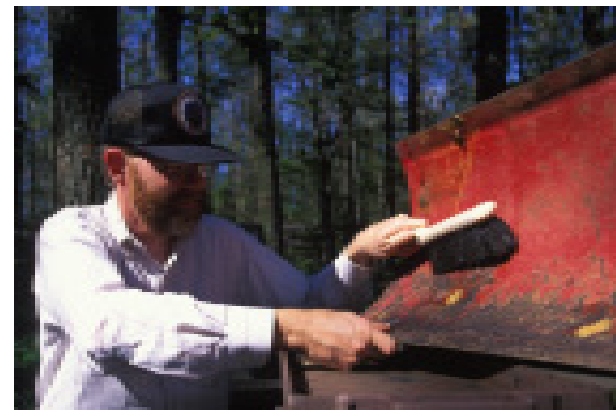
The giant African snail (top) and other snails can hitchhike into the United States on outdoor household goods. Be sure to clean all goods and equipment before packing and returning to the country.