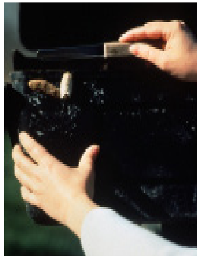
If you find gypsy moth or other egg masses, scrape them into a container of hot water, household bleach, ammonia, or kerosene.