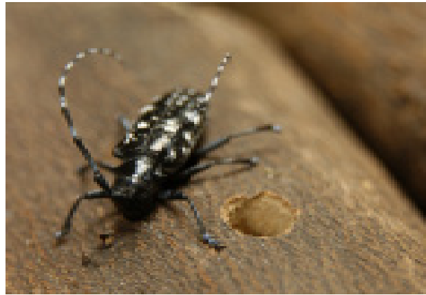
The Asian longhorned beetle—a major forest pest in the Far East—hitchhiked into the United States in the mid-1990s inside the low-grade wood used to make pallets and crates for cargo. A Chicago citizen discovered the beetle and reported it to APHIS, proving again how important the public can be in helping keep our country free of foreign insects.

For more information, point your Web browser to < http://www.aphis.usda.gov >.