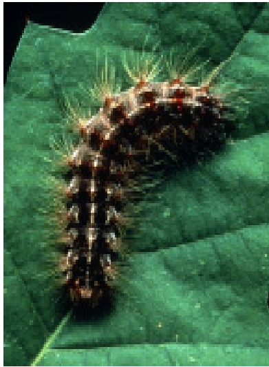
Gypsy moths defoliate trees and shrubs. Further introductions of this pest could cause widespread damage to plants on both private and commercial land in the United States. APHIS file photos show a gypsy moth caterpillar and an adult male (top right) and female with egg mass (lower right).