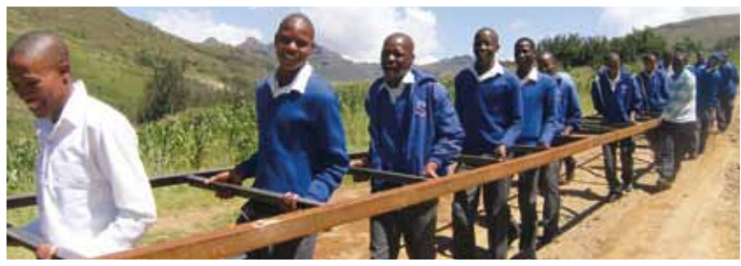
Students in Lesotho help build a bridge funded through PCPP.

“A lesson I learned from this PCPP grant was the importance of having the project come from the community. Allowing the community members to take control and have ownership of the project allowed this health structure to truly be theirs.”