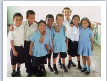
Kindergarten students in Costa Rica are among those benefiting from a PCPP project.

Thank you to USAID for 30 years of small grants collaboration!