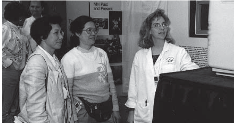
Staff from the Clinical Center's rehabilitation medicine department manned a booth at the fair; many of the ICDs sponsored booths offering NIH'ers and visitors the latest information on a variety of health topics.