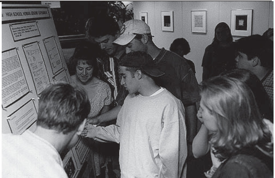
Area high school students present results from their DNA sequencing projects as part of NCHGR's recent DNA Sequencing Partnership wrap-up.