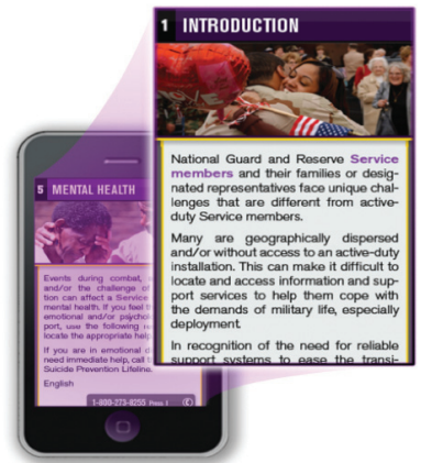
The YRRP Resource Guide app offers comprehensive and convenient access to Program information and resources.

The app is available for download with the use of a free access code card while supplies last. To request a card for individual use or multiple cards for distribution at a YRRP event, please contact your local YRRP Program Specialist via: www.yellowribbon.mil/about/program-specialists .