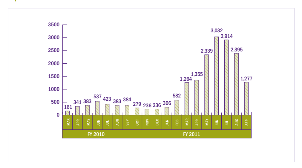
FIGURE 4.7, TAS Monthly Pre-Refund Wage Verification Hold Receipts, March 2010 Through September 2011<sup>56</sup>

The civil side of the QRP is now referred to as the Accounts Management Taxpayer Assurance Program (AMTAP). To accomplish its primary goal of revenue protection, AMTAP selects questionable returns before releasing refunds and screens them electronically to verify the accuracy of the taxpayers' wages and withholding. If this initial review cannot confirm the amounts, AMTAP employees begin a manual verification process that can take up to 13 weeks or more.<sup>57</sup> Such delays can create financial hardship for taxpayers who are awaiting legitimate refunds.