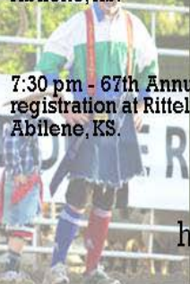
Fun For All Ages!

For more information visit: http://www.wildbillhickokrodeo.com/