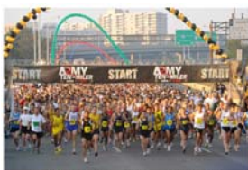
October 21, 2012

The annual Army Ten Miler will open priority registration on May 1. The requirement for priority registration is that you have either run the ATM 7 times or more OR you are a U.S. service member. Military MUST use a .mil email address to register. General registration will open May 15. There will be 20,000 registrations