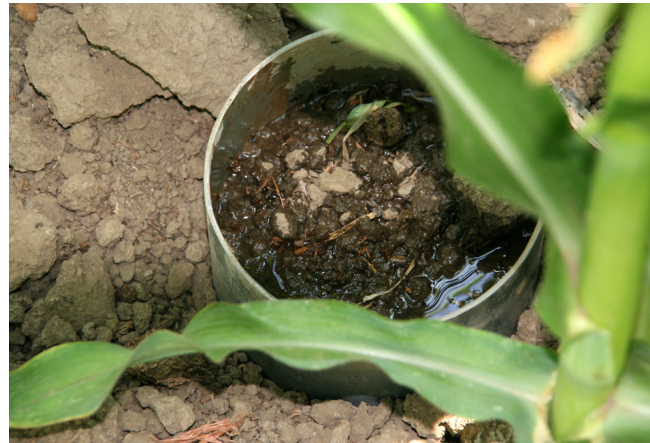
Figure 3 Soil quality affects water movement into and through soil, water storage and water quality