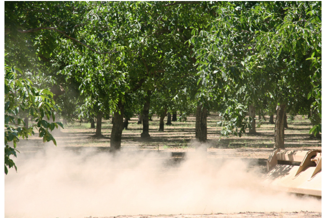
Figure 3 Soil quality affects water movement into and through soil, water storage and water quality