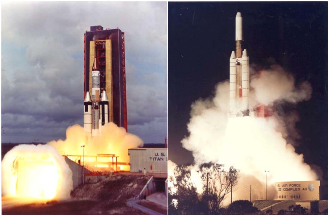
Left: A Titan IIIC launches seven satellites for the Initial Defense Communications Satellite Program and one experimental satellite on 16 June 1966. Right: A Titan 34D rises from the pad at Cape Canaveral.

Thor and Atlas boosters were complemented by the Titan III, a powerful booster capable of launching large, heavy payloads. Development of the Titan III was initiated in late 1961, and the first research and development vehicle was flown on 1 September 1964. This vehicle, a Titan IIIA, consisted of a modified Titan II core topped by an upper stage called the Transtage. A new configuration, the Titan IIIC, was successfully launched from Cape Canaveral on 18 June 1965. The IIIC used two strap-on solid rocket motors that generated around one million pounds of thrust each. From 1965 through 1989, Titan III vehicles performed well in a wide variety of missions and configurations. The family expanded to include the Titan IIIB Agena D, the Titan IIID, and the Titan IIIE Centaur, which was used by NASA for space projects such as the Viking missions to Mars. The final variety of Titan III, the Titan III (34)D, was used during the 1980s as a backup and alternative to the manned Space Shuttle. The last 34D was launched on 4 September 1989.