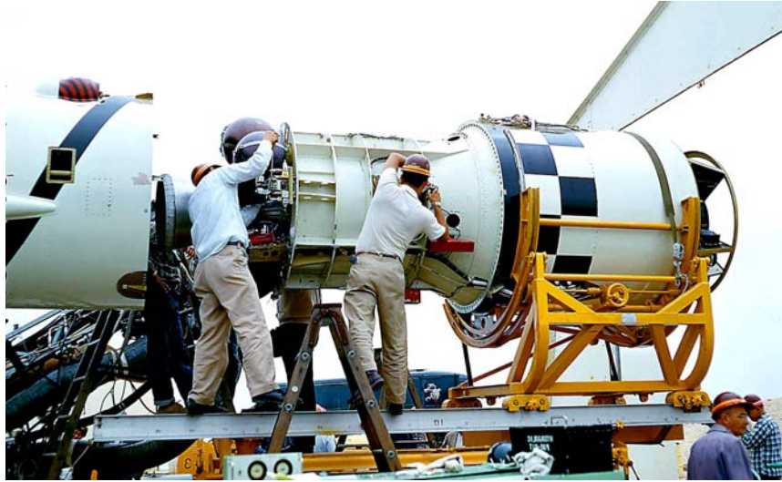
Top: Agena A spacecraft 1056 for Discoverer XIV is being integrated with Thor 237 before launch on 18 August 1960. Bottom left: The first Thor Agena launch vehicle sits on the pad at Vandenberg AFB before launching Discoverer I on 28 February 1959. Bottom right: The first Atlas Agena combination rises from the pad at Cape Canaveral in an unsuccessful attempt to launch MIDAS I on 26 February 1960.