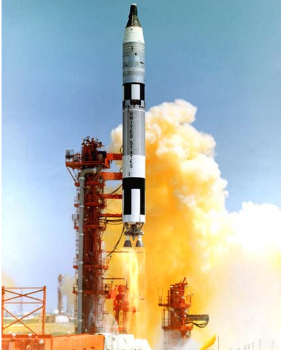
Left: A Titan II launch vehicle developed by Space Systems Division from the Titan II missile launches a manned Gemini capsule from Cape Canaveral. The Gemini missions took place during 1965-1966. Because they launched astronauts, these Titan IIs had to be "man-rated," meaning that they had to be made as safe as possible by adding redundant systems wherever that could be accomplished, by thoroughly inspecting for errors, and by giving the manufacturers incentives to build launch vehicles that were free of defects. After they were in orbit, the manned Gemini capsules accomplished rendezvous and docking with unmanned Agena Target Vehicles, also developed by Space Systems Division, perfecting techniques that would be used later in the Apollo program.