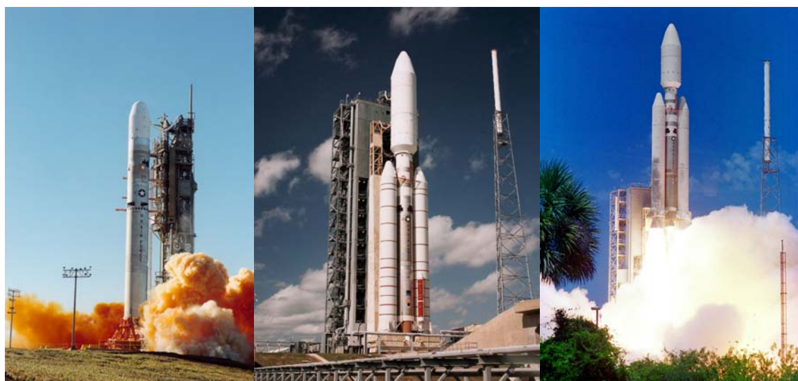
Left: A Titan II launches the first DMSP Block 5D-3 satellite on 12 December 1999. Center: A Titan IVA on the launch complex at Cape Canaveral before launching the second Milstar satellite on 6 November 1995. Right: A Titan IVB launches a satellite for DOD in 1999.

the Centaur upper stage. It was capable of placing 10,000 pounds into geosynchronous orbit using the Centaur. The Titan IV's performance would be considerably enhanced by upgraded solid rocket motors. Their development was delayed when the first qualification motor exploded during a test firing on 1 April 1991, but they successfully completed the final test firing on 12 September 1993. Vehicles without the upgraded motors were known as Titan IVAs, and those with the new motors were called Titan IVBs. For some smaller payloads, Space Division began converting the obsolete Titan II ballistic missiles that had been removed from their silos during 1982-1987. 7 They could place about 4,200 pounds into low-earth, polar orbit, and the first was launched on 5 September 1988.