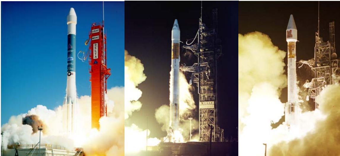
Left: The first Delta II launches the first GPS Block II satellite on 14 February 1989. Center: An Atlas IIA launches a DSCS III satellite on 20 January 2000. Right: An Atlas IIAS launches a satellite for the NRO on 7 December 2000.

Development and production of the Atlas II, an improved version of the Atlas/Centaur launch vehicle, began in June 1988. The Atlas II would be able to launch somewhat heavier payloads in the medium-weight class, and DOD intended it for Defense Satellite Communications System (DSCS) satellites as well as some experimental satellites. It was also used in many commercial launches. Lockheed Martin, the developer, launched the first commercial payload to use an Atlas II on 7 December 1991, and it launched the Air Force's first DSCS III satellite on 11 February 1992. In 1995, SMC began using a modification of the Atlas II known as the Atlas IIA, which employed a more powerful Centaur upper stage, and Lockheed Martin soon developed a further modification, the Atlas IIAS, which employed four strap-on solid rocket motors. The first military payload to use the Atlas IIAS was launched on 6 December 2000. By early 2003, about 15 military payloads, including four DSCS III satellites, had been launched on the Atlas II, IIA, and IIAS without any failures. In 1999, SMC used the existing Atlas contract to procure launches of a new Atlas vehicle, the Atlas III, that used a single-stage main propulsion unit called the RD-180. The RD-180 was designed and manufactured by a Russian contractor, NPO Energomash. One of the features that made the engine versatile for space launches was that it could be throttled on command to higher or lower thrust while in flight.