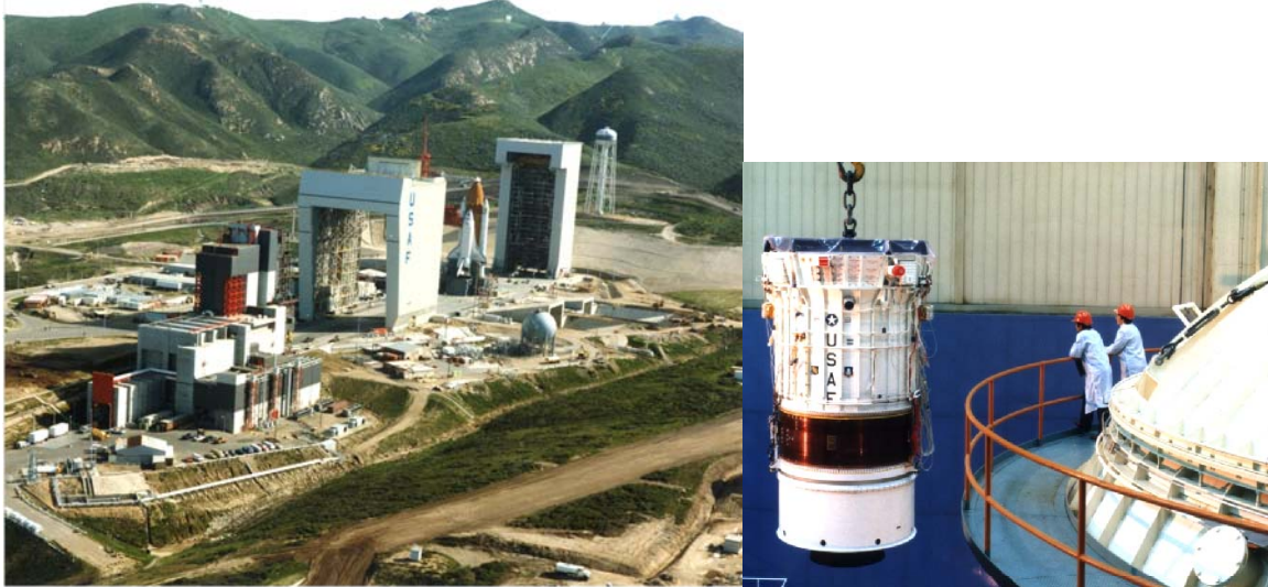
Left: The Space Shuttle's test orbiter Enterprise is used for a fit check at SLC-6, the almost completed STS launch facility at Vandenberg AFB, in November 1984.

the Inertial Upper Stage (IUS), an upper stage for large Shuttle payloads requiring higher orbits. The IUS was adapted for use with the Titan III and, later, the Titan IV expendable system as well. Although it had a troubled and costly developmental period, the IUS came to be considered an accurate and reliable launch system.