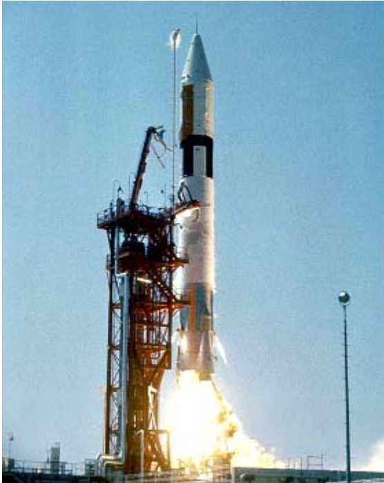
Left: The first Atlas Centaur combination rises briefly from the launch complex at Cape Canaveral on 8 May 1962. The Centaur exploded 55 seconds later. Below: The first Centaur upper stage is unloaded after air transport to Cape Canaveral on 25 October 1961.

Agena upper stage, was also developed by Space Systems Division (SSD). The Agena was later modified by NASA and employed extensively by both agencies. The Centaur upper stage, the most powerful upper stage in the national inventory, was born as an Air Force program before being transferred to NASA in 1960. It is noteworthy that much of this cooperation in developing and using launch vehicles was the result of a carefully considered series of written agreements, initiated in 1959 and expanded during the early 1960s, which made up a National Launch Vehicle Program.