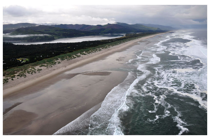
The whole Oregon state was imaged in a single 5-day survey during June 2011. This photo was taken by Mary Morris near the mouth of Nehalem Bay, off Manzanita.

During the first week of June (1st-5th), the whole state shoreline was flown and imaged! "It is a straight line pretty much!" says Mary Morris. "The coast is extremely dynamic with very high energy, lots of sandy beaches and large estuaries." Logistics were as challenging as southeast Alaska, but in quite a different way. Rather than a survey design based in a central location with daily radial transits to shoreline targets, the linearity of the Oregon coast required the development of a series of flexible plans that could be modified or interchanged based on weather conditions and previous day's videography coverage. "We were blessed by the weather gods, and the optimal sequence was realized," Sheri Ward explains, "enabling the survey to be completed within