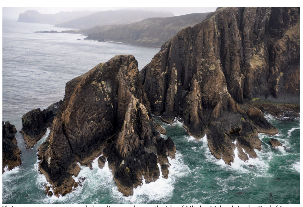
Flying over a very exposed shoreline on the south side of Ukolnoi Island, in the Pavlof Islands group, western Alaska Peninsula.

Presentations are accessible on the Shorezone.org web site. What struck most attendees is the number of applications that ShoreZone is being put to by a variety of users, from habitat modeling for sea urchins to oil spill response and planning.