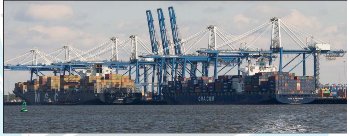
Post-Panamax ships, like the MSC Rita (left), can currently only come into Charleston Harbor on high-tides.

The District will also run ship simulations at the different depths with different weather conditions to see how the harbor would be affected and consider the safety of the ship and those in the harbor. The effects on marine life will also be reviewed to minimize disruption to their natural habitats. Where to dispose of the additional maintenance material dredged from the harbor floor and what the life of the harbor will look like over the course of the next 50 years are other questions that have to be answered when conducting the feasibility study.