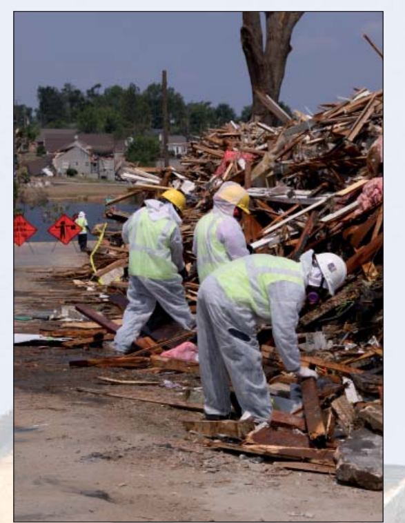
A segregation crew separating debris that contains asbestos.