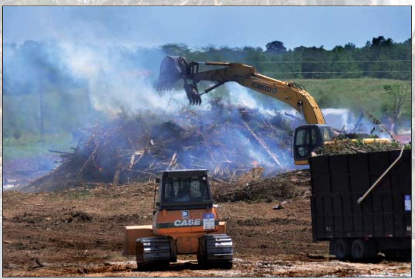
Machinery piles vegetative debris into a burn pit.

up shingles, siding, etc. as the result of destroyed buildings, as well as vegetative debris of trees, stumps, brush, etc. Vegetative debris is either taken to a burn pit or is ground and recycled for various uses. C&D is taken to a designated landfill where it is crushed and covered with dirt. It is estimated that the Corps will remove