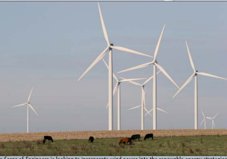
The Corps of Engineers is looking to incorporate wind power into the renewable energy strategies of Army facilities where reliable wind resources can be harnessed.

Many utility companies in coastal states are pursuing offshore wind power projects. Locations up to three miles offshore are considered state waters, while locations