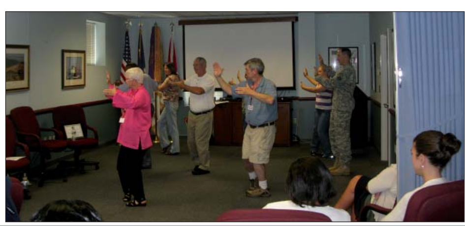
Thanks to all our presenters for sharing their knowledge with an eager Team Charleston!

portation cargo movements and to provide traffic and port management for the Department of Defense in peace and crisis. She concluded her presentation by stressing the importance of teamwork and giving back.