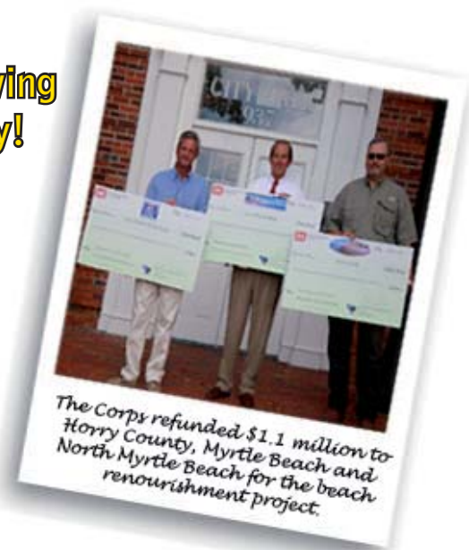
The Corps refunded $1.1 million to Horry County, Myrtle Beach and North Myrtle Beach for the beach renourishment project.