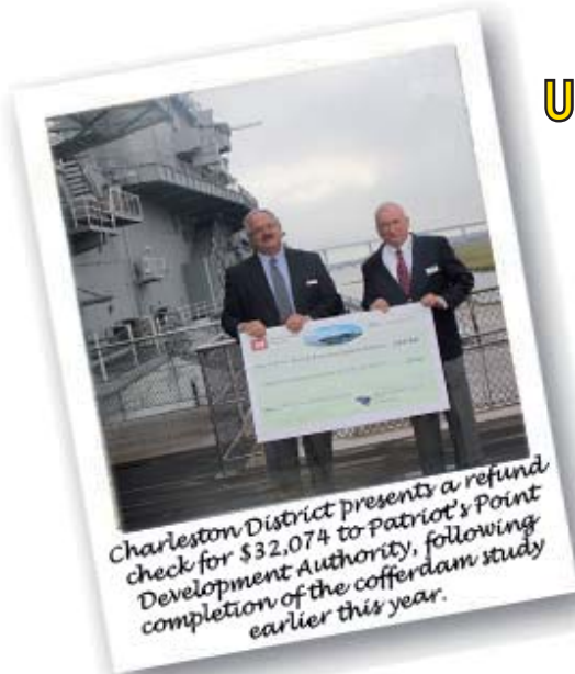
Charleston District presents a refund check for $32,074 to Patriot's Point Development Authority, following completion of the cofferdam study earlier this year.

"Excellence - the unlimited ability to improve the quality of what you have to offer" - Rick Patino.