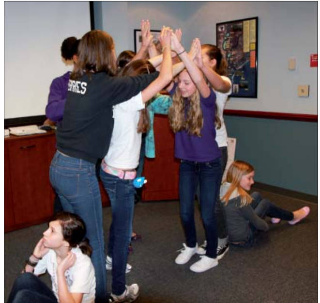
Students from Ashley Hall build a human arch to learn what makes a strong structure.

from other federal agencies learned about the District and its mission