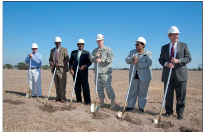
Matthews Industrial Park Water Tank will provide safe drinking water to the area.