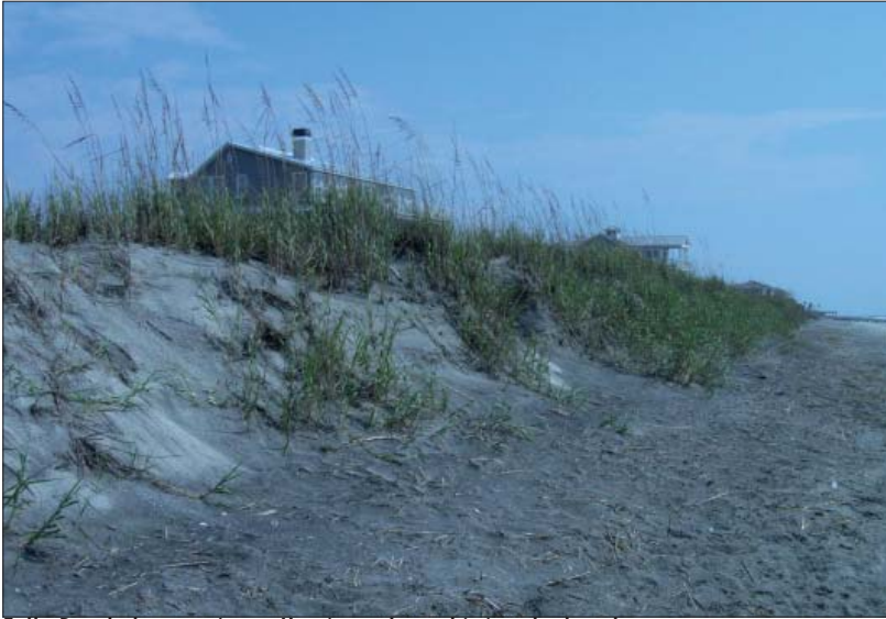
Folly Beach dunes prior to Hurricane Irene hitting the beach.