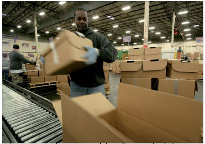
A DLA employee works on a conveyer belt, similar to one that the District recently performed maintenance work on.

to exceed $12 million over the potential five year performance period, for general design services supporting the DLA Distribution SRM program