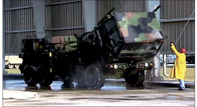
An Army vehicle is being serviced by an ASLAC employee.

ing new roll-up doors and paving storage areas. ASLAC's mission is to provide equipment maintenance to all types of Army tactical cargo.