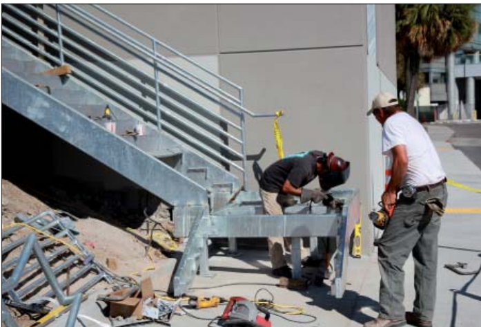
Work progresses quickly at the Charleston VA hospital.