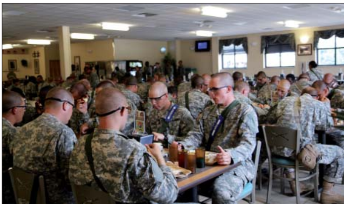
Soldiers at Fort Jackson enjoy lunch in a recently completed DFAC.