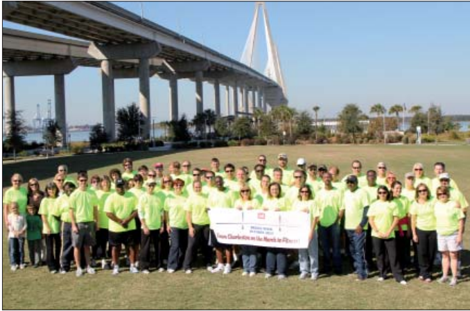
Team Charleston walks the Arthur Ravenel, Jr. Bridge for the annual bridge walk that promotes a healthy lifestyle.