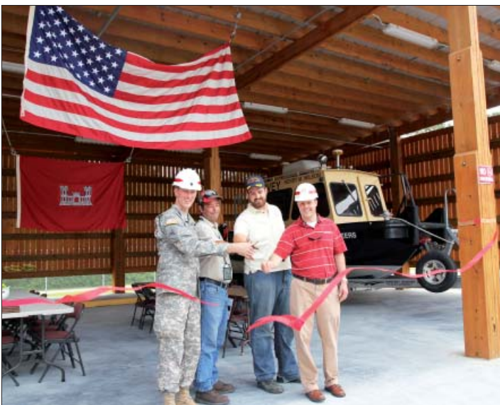
A successful ribbon cutting at the new boathouse at the Lowcountry Office.