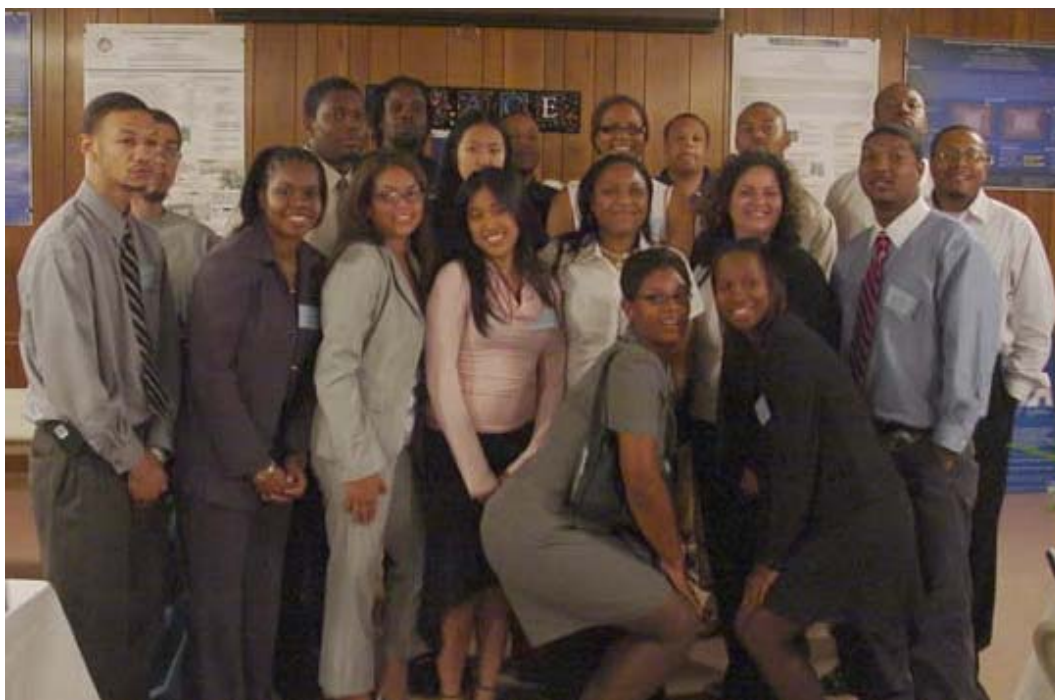
2004 RAMS participants.

While there is no complete record of where former RAMS participants are today, partial data highlight the program's success. About 75% of recent RAMS participants from Fisk University, an HBCU in Nashville, Tennessee, went on to graduate school in computational sciences and engineering related fields, according to Stephen Egariwe, a computer scientist and nuclear physicist who serves as the main RAMS connection at Fisk.