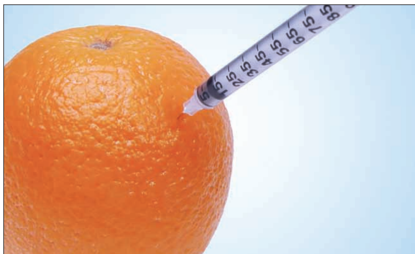
Researchers Debate the Role of IV Vitamin C as a Cancer Treatment

Vitamin C is commonly known to be essential to human health. However, specifically as it relates to cancer treatment, the value of vitamin C is debated and often considered a topic of scientific controversy. Cancer researchers have investigated various ways of administering high-dose vitamin C, including both orally and intravenously. Researchers have also examined different forms of vitamin C—ascorbic acid (AA) and dehydroascorbic acid (DHA)—which may well be a comparison of apples and oranges.