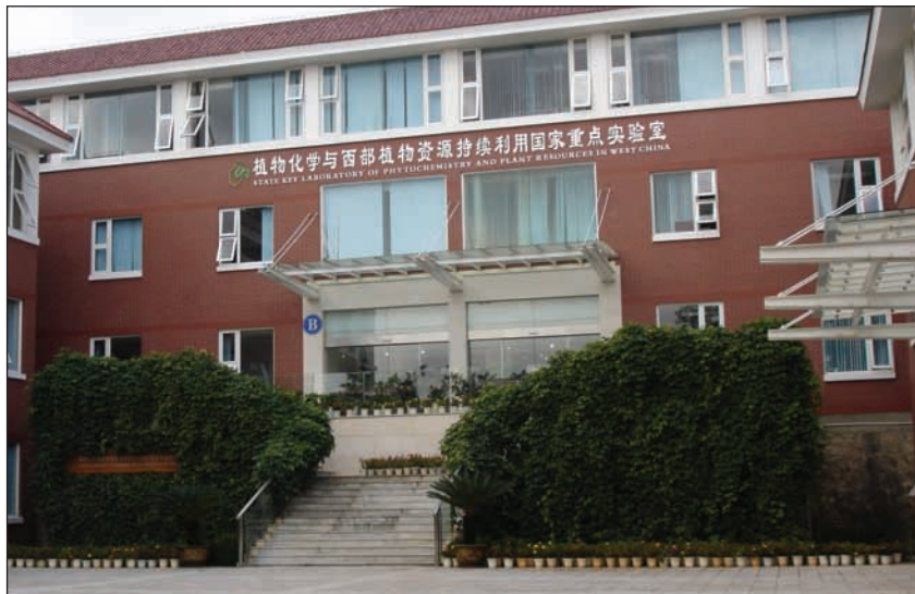
KIB's State Key Laboratory of Phytochemistry and Plant Resources

In July 2008, the United States government signed a research agreement with China to foster collaboration between researchers studying integrative and Traditional Chinese Medicine (TCM) in both countries. One of the first and most promising of these projects is a partnership between the Kunming Institute of Botany (KIB) of China Academy of Sciences and two groups at the National Cancer Institute (NCI).