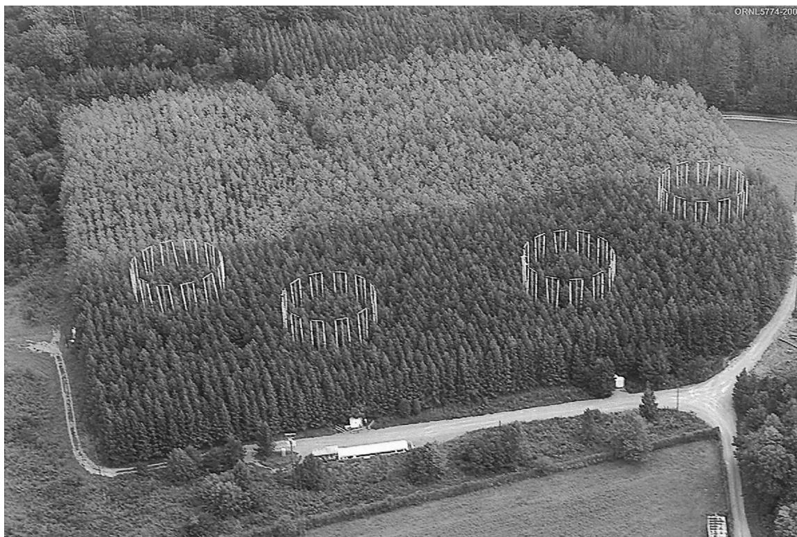
FIG. 1. The Oak Ridge FACE facility in a Liquidambar styraciflua plantation. The two rings of towers on the left surround plots receiving elevated CO 2 , and the two plots on the right are control plots that receive no added CO 2 . A third control plot without towers is not visible in the center. Each of the plots is 25 m in diameter. Details about the site and facility operations were presented by Norby et al. (2001).