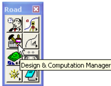
Figure 8-32: Design & Computation Manager Icon