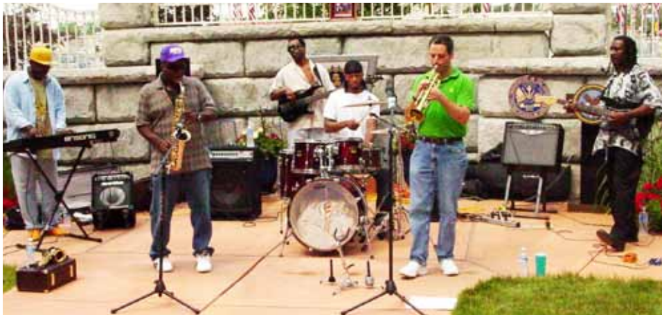
Jazz in the Park