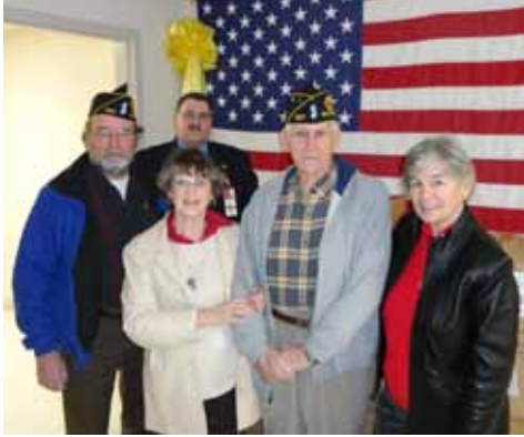
Despite the recent devastation caused by hurricane Irene in the Prattsville area, members of the American Legion Virgil E. Deyo Post #1327 and American Legion Auxiliary Unit #1327 continue to provide substantial donations of goods for Veterans at the Stratton VA Medical Center.