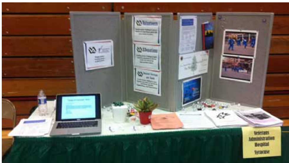
Syracuse VA participated in a Youth Volunteer Recruitment Fair at Marcellus High School.

Syracuse Voluntary Service participated in Volunteer Fairs over the past few months. Every year the Voluntary Service office has an active recruitment program with local middle schools and high schools. Many of the students recruited are interested in health careers after graduation. Voluntary Service has developed connections throughout the Medical Center to place students in areas that might give them an awareness of different career choices available in a Medical Center. Many of the students return each year to participate at the Syracuse VA.