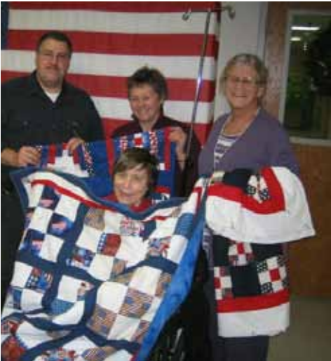
Members of the Ticonderoga Chapter of the New York State Daughters of the American Revolution donated beautiful handmade quilts and custom picture books for our Veterans this past Holiday Season.