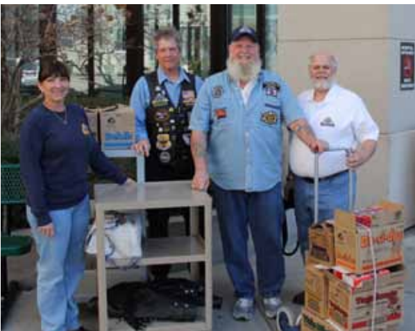
Several members of the Patriot Guard Riders of New York donated their time and over one hundred boxes of Girl Scout cookies to the Medical Center. The cookies were distributed to Veterans on Heroes Way, Victory Lane, Behavioral Health and Adult Day Health.

Science Applications International Corporation (SAIC) , a Fortune 500 scientific, engineering and technology applications company, has partnered with the Stratton VA Medical Center to help our local Veterans with their Military Alliance Group's (MAG) "Sweats for Vets" program."