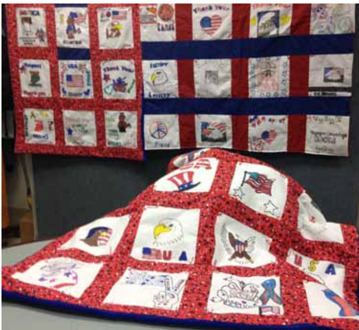
Handmade quilts have been received from a couple of local organizations. The Center for Learning in Auburn donated the handmade quilts shown in the photo. These quilts were provided to Veterans who served in the current conflicts.