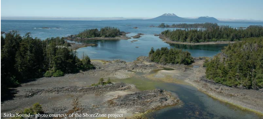
Sitka Sound – photo courtesy of the ShoreZone project

This report provides highlights of Habitat Conservation Division (HCD) activities in support of the sustainable management of living marine resources from October 1, 2006 through September 30, 2007.