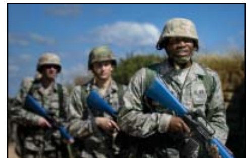
Basic trainees march through an “improvised explosive device lane” during field training. This training is done during Basic Military Training at Lackland Air Force Base, Texas.

At the heart of this new BMT program is a new complex they call the Basic Expeditionary Airman Skills Training, the BEAST. It focuses on expeditionary skills such as weapons training, dealing with improvised explosive devices, and basic defense skills for ensuring survival of the base as well as one’s own skin. Think of it as an Operational Readiness Exercise, but by design, even more intensive for a trainee. Trainees take full responsibility for the day to day operation of their “base” during the four-day exercise. The objective is to test the Airman’s ability to think,