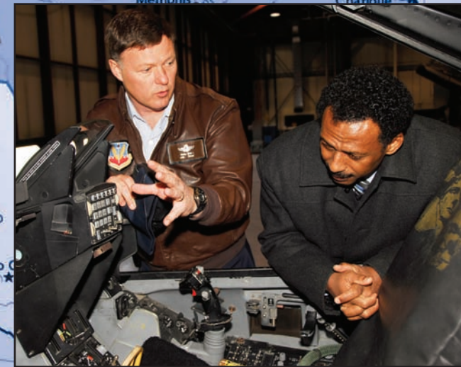
< Col. Russ Walz, 114th Fighter Wing commander, explains the cockpit of the F-16 Fighting Falcon to Suriname Defense Minister Ivan Fernald here Feb. 25.