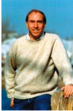
Gerry E. Studds 1937–2006

Gerry Eastman Studds, former Congressman from the Massachusetts 10th District (1973–1996) and tenacious advocate for the ocean. Congressman Studds authored the National Marine Sanctuaries Reauthorization and Improvement Act of 1992, which officially designated the Stellwagen Bank National Marine Sanctuary. His legacy lives on in the sanctuary's research, education and conservation efforts, as well as in the vast array of marine legislation that he eloquently supported. In honor of his dedication to marine issues, Congress renamed the sanctuary the Gerry E. Studds Stellwagen Bank National Marine Sanctuary during the 1996 reauthorization of the Sanctuaries Act.