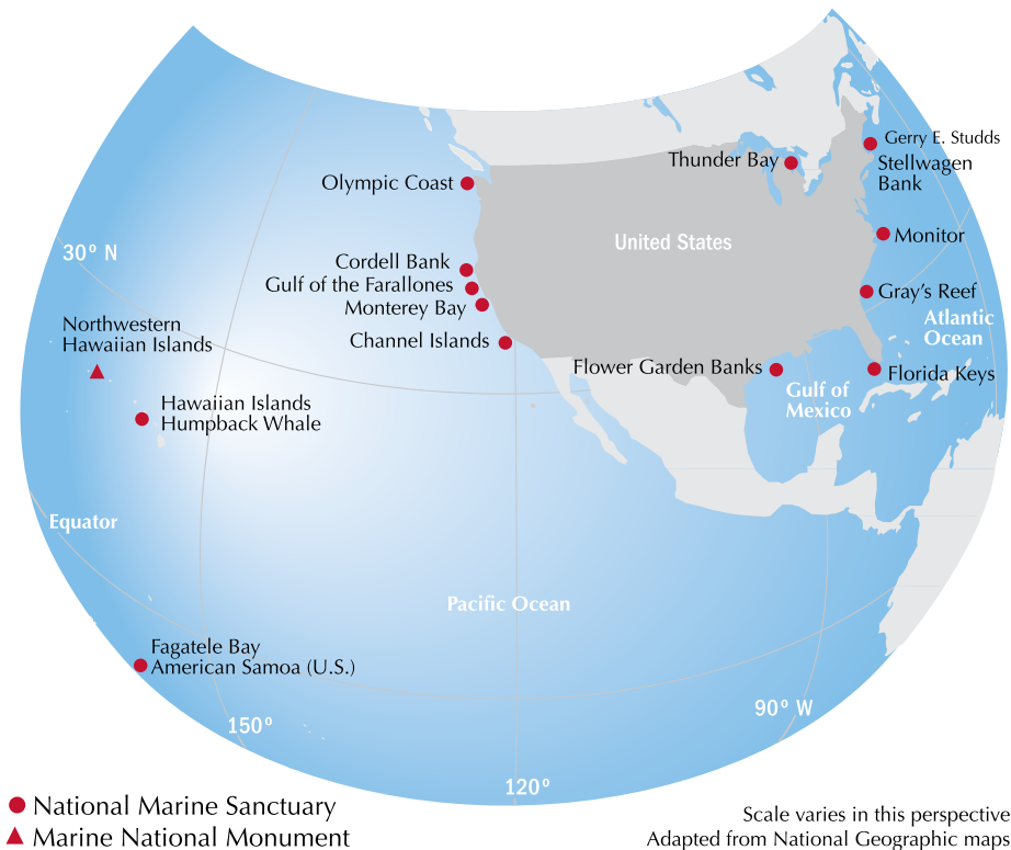
FIGURE 1. THE SYSTEM OF NATIONAL MARINE SANCTUARIES.

to promulgate regulatory changes where necessary, and monitors intra- and inter-agency agreements.