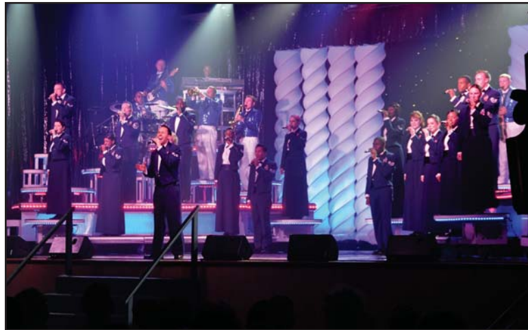
Tops In Blue, the U.S. Air Force's premiere entertainment showcase wraps up their show at Packard Music Hall in Warren, Ohio with a medley of patriotic songs, Sept. 11. The group is made up of active duty, Guard and Reserve Airmen.