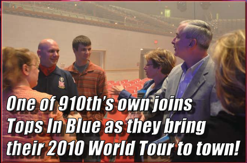
One of 910th's own joins Tops In Blue as they bring their 2010 World Tour to town!