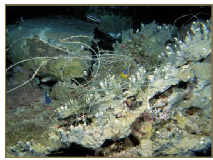
Monofilament line is reported regularly by scuba divers visiting Stetson Bank

Shrimp trawl nets, boat anchors, twisted metal and fishing line scatter the surface of Stetson Bank, a mid-shelf bank in the northwestern Gulf of Mexico. Comprised of a main feature and a deep 'outer ring' of claystone outcroppings atop a salt dome formation, Stetson Bank provides an 'island' of productive, shallow habitat for the growth of coral and sponge communities which, in turn, are home to an array of invertebrates, bony fishes, sharks and turtles. The main feature of Stetson Bank is protected within the Flower Garden Banks National Marine Sanctuary, while the deep 'outer ring' lies within a Habitat Area of Particular Concern (a Gulf of Mexico Fishery Management Council designation).