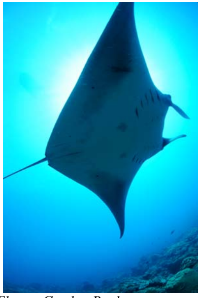
Two of the manta rays sighted at East Flower Garden Bank.