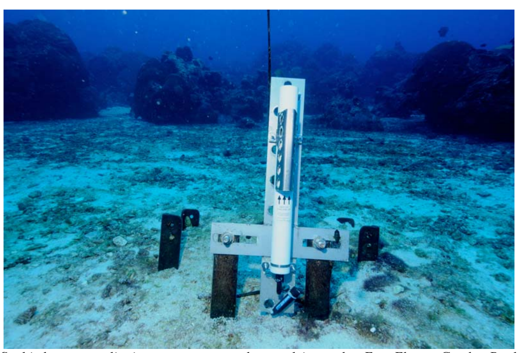
Seabird water quality instrument mounted on rack in sand at East Flower Garden Bank. This instrument measures temperature and salinity. The instrument rack has been partially buried by sand shifting as a result of Hurricanes Rita (2005) and Ike (2009).