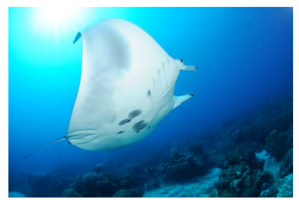
Two additional mantas sighted at East Flower Garden Bank

We also worked with Sarah to roll up what is left of her recruitment rack – in preparation for a future removal. Sarah had put out the rack to look at coral recruitment, but unfortunately nature had other plans for the sand patch – the 2008 hurricane season did some major rearranging! There was no current, visibility was great – about 100', and temperature was 84F.