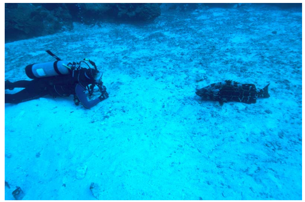
Black grouper making friends with Emma.

After conducting our work at the West Bank, we returned to the East Bank to continue our spawning observations and research.