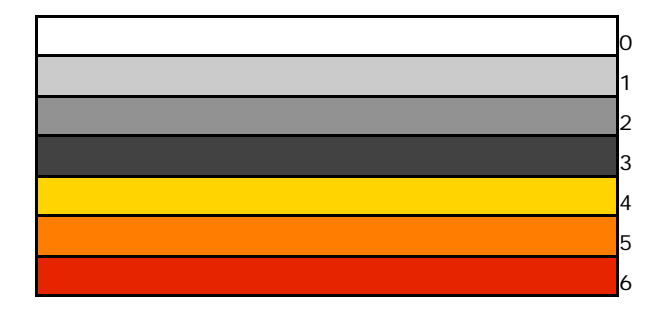
Table 1. Colors convey least (0) to most (6) confidence in prediction that spawning will occur in these blocks of time. This has been determined from a combination of levels of spawning and the number of times the observations have been made, from 2000 to 2006, which includes nine separate spawning events.