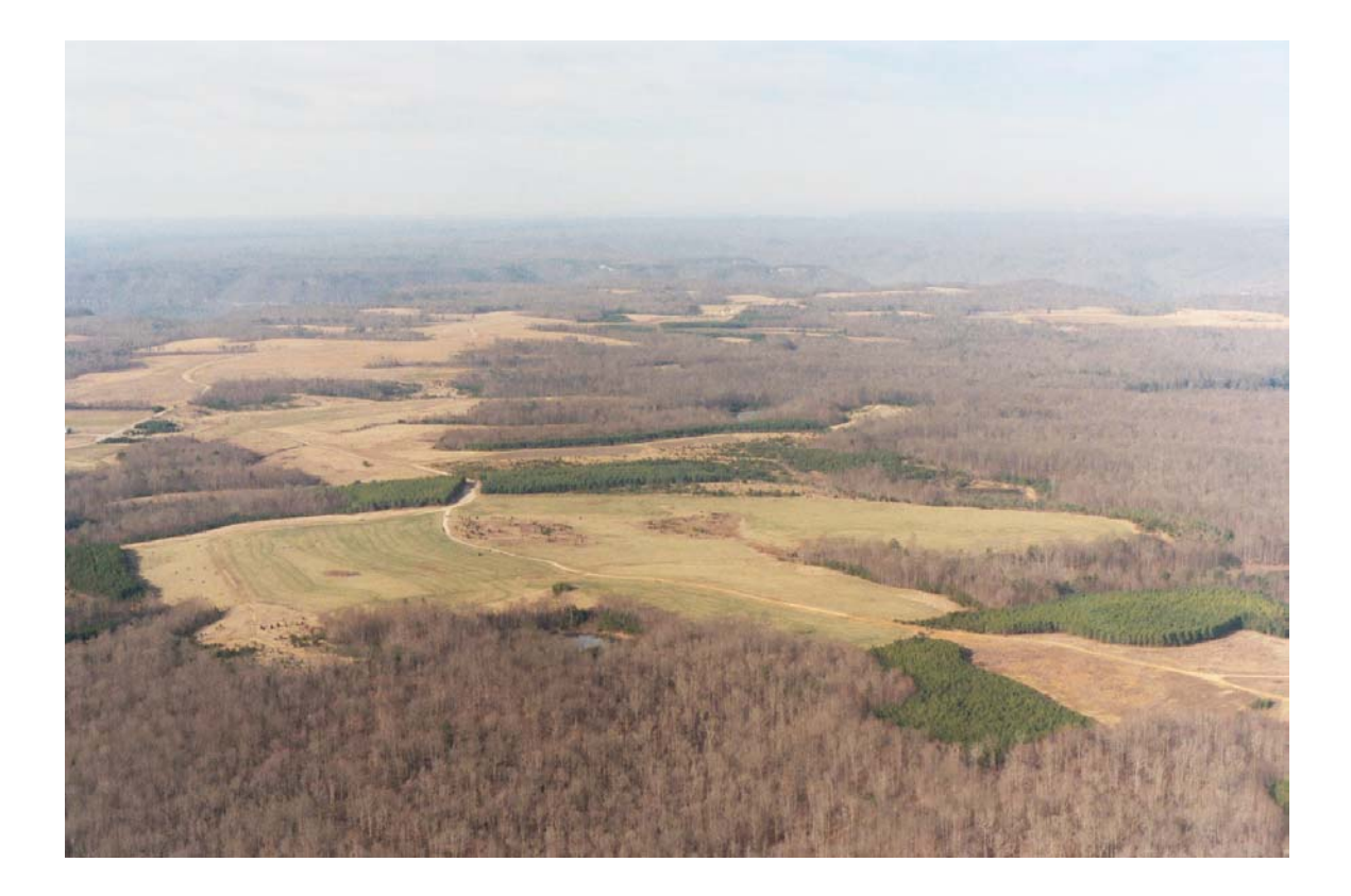
Fig. 1. Aerial view of Northern Cumberland Plateau near Jamestown, TN, displaying a matrix of forest-types and land uses.