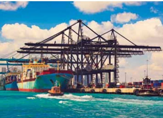
Container ships at the industrial port of Miami, Florida. The port is among the top 11 container ports in the United States and in 2010 processed approximately 7.4 million tons of cargo. Improving supply-chain infrastructure such as port facilities is one of the recommendations of the 2011 National Export Strategy.

The challenge to the U.S. business community from President Barack Obama in January 2010 was bold, and came in the form of a very specific goal announced during his State of the Union message: double U.S. exports by the end of 2014. The vehicle for reaching that goal was subsequently given substance with the National Export Initiative (NEI) and the first-ever Export Promotion Cabinet.