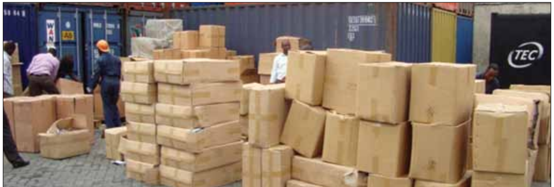
In May, Kenyan customs officials intercepted a shipment of more than 140,000 fake Hewlett Packard (HP) packaging components and labels.