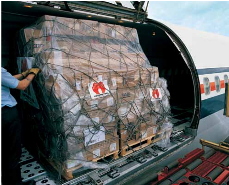
Freight being loaded on a jet plane. Freight forwarders handle 80 percent of U.S. exports, and are vital link in the supply chain.