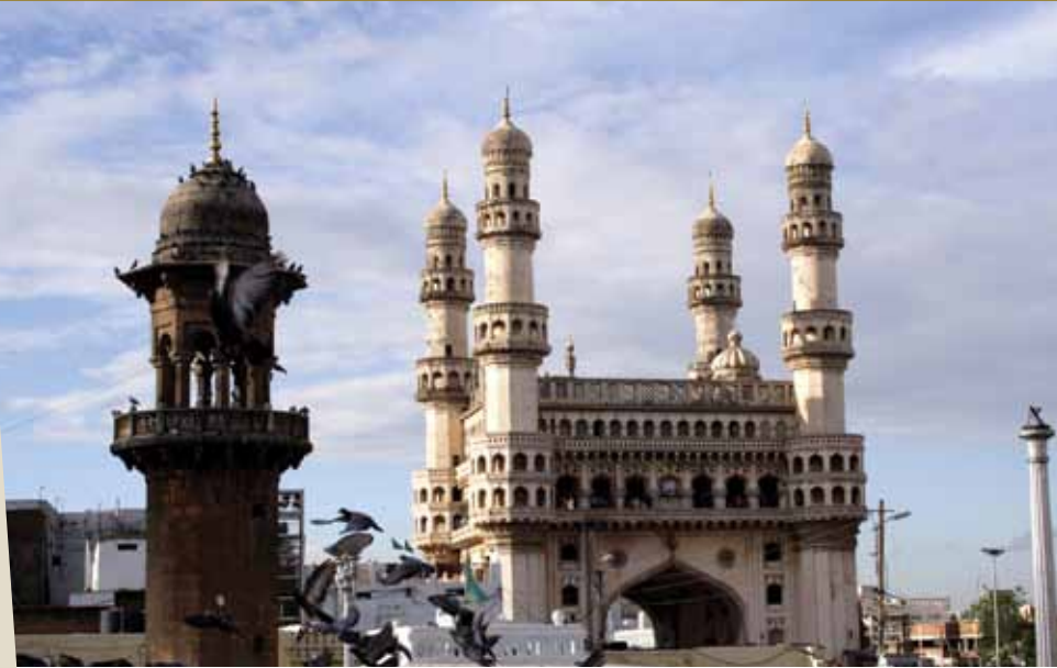
Charminar, a 16th century monument in Hyderabad, India.