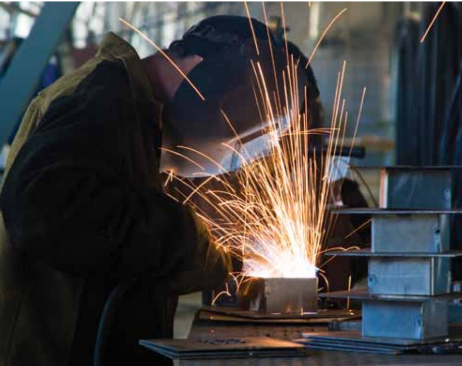
U.S. exports of goods grew from $1.1 trillion in 2009 to $1.3 trillion in 2011. Sustaining this growth will require continued efforts to help more U.S. companies begin exporting.

O n June 27, 2011, I had the opportunity to travel to West Virginia to discuss progress on President Barack Obama's National Export Initiative (NEI) and to promote U.S. manufacturing exports. As you probably know, the NEI, announced in 2010, aims to double U.S. exports by the end of 2014. I am glad to report that the NEI is off to a good start. Exports last year composed 12.5 percent of gross domestic product, which is up from 11.2 percent in 2009.