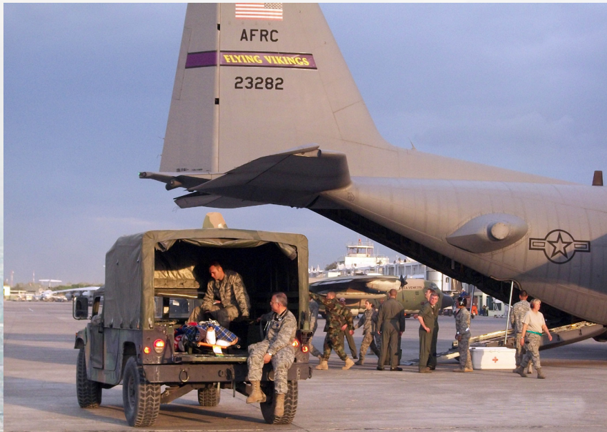
934th Airlift Wing members pick up patients and drop off supplies at Toussaint L'ouverture International Airport, Port-au-Prince, Haiti, Jan. 26.