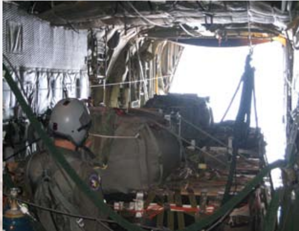
A loadmaster from the 96th Airlift Squadron readies the LCADS and SWAD systems for an airdrop in Arizona.

The 13-person team, which was comprised of members from the 934th Operations Group, 934th Operations Support