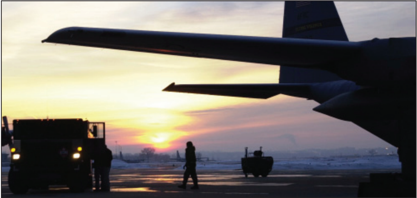
Ground crews prep a C-130 that can carry up to ten Space A travelers.