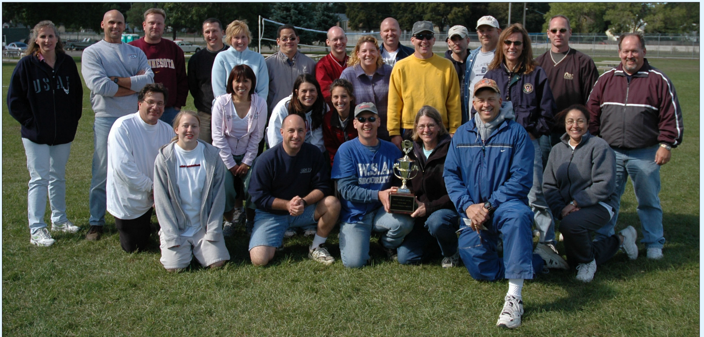
The MSG team poses with the Commander's Trophy.