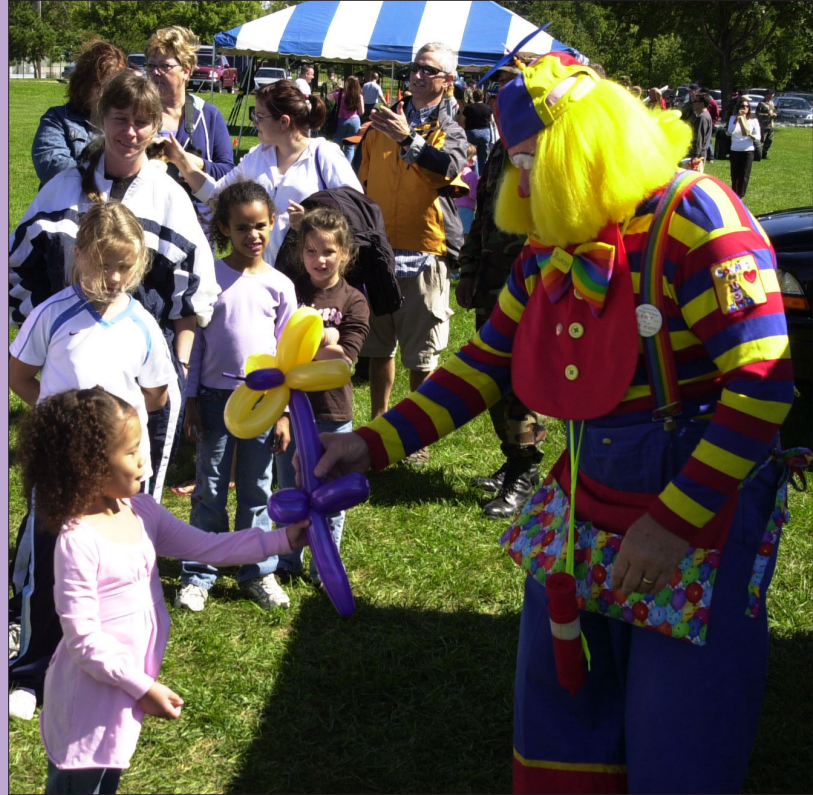
Balloon sculptures were popular with the children.