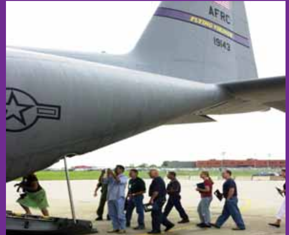
Employers board a 934 AW C-130 Hercules.