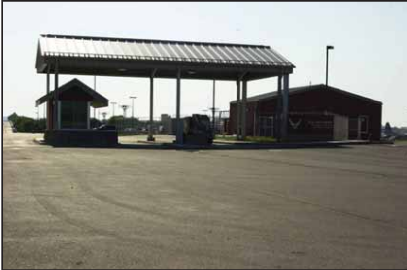
The new gate will offer a full range of services.

The new gate will also have increased traffic this fall as the inter-base gate will be closed for military exercises on the Air National Guard installation.