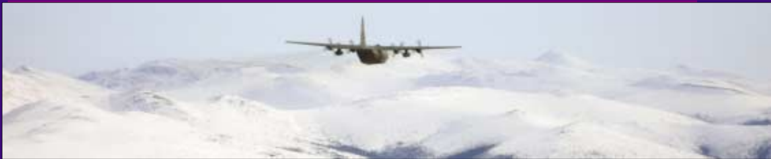
A 934th Airlift Wing C-130H flies over the Alaskan mountains during RED FLAG Alaska.