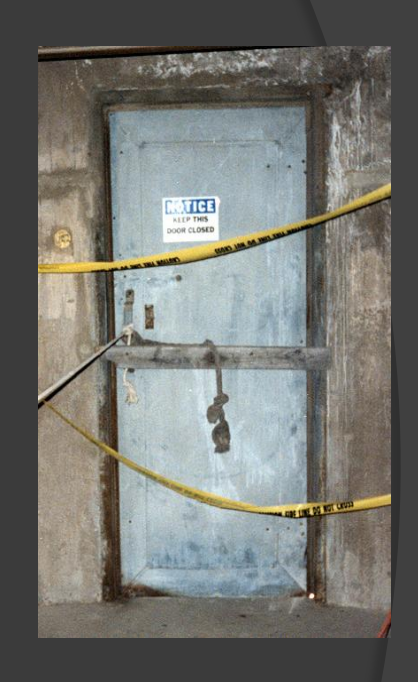
Locked and blocked exit