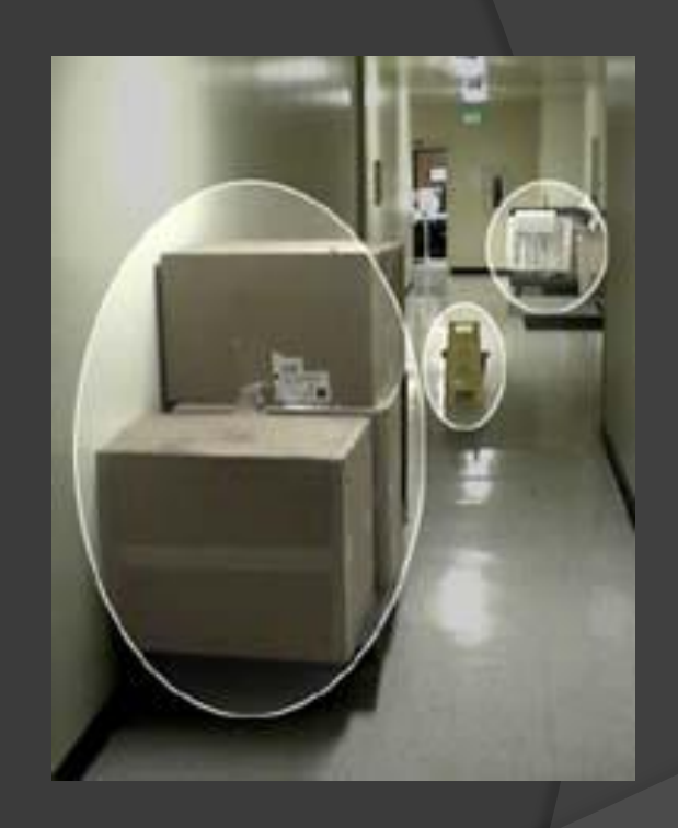
Obstructed exit route