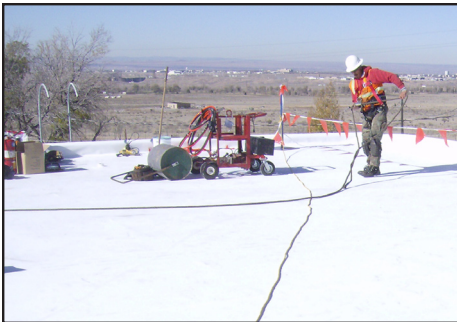
HSS re-roofs several of the NTC's facilities in Albuquerque, NM, with energy efficient and environmentally friendly materials.