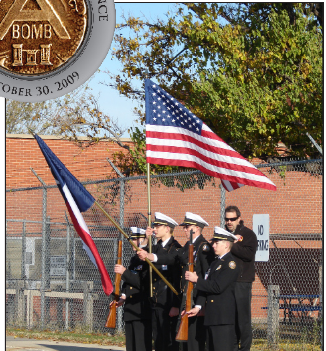
Scene from Pantex Celebration

Day of Remembrance Celebrated Throughout DOE..... 1