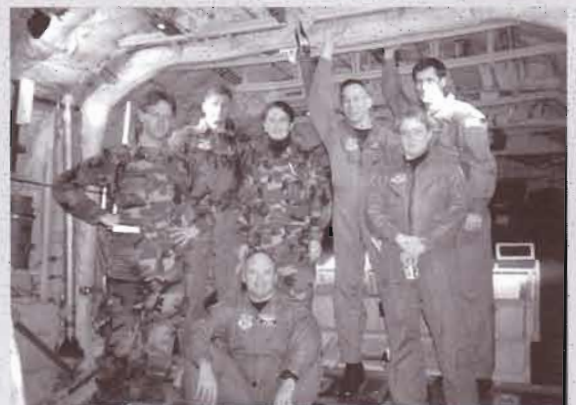
934th Critical Care Team