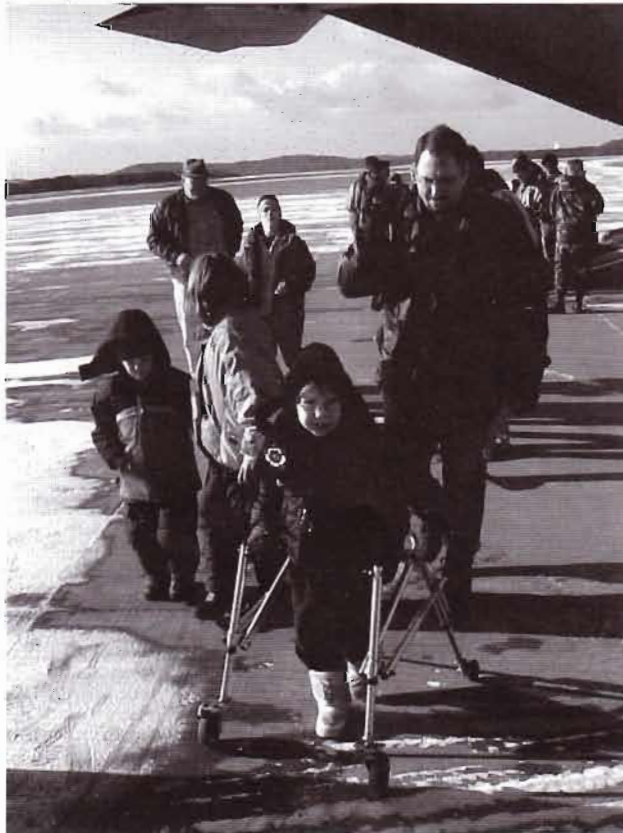
Children make their way from the C-130 to "the North Pole."

Once the children arrived at "the North Pole," Santa was waiting to read to the children. Santa also had presents for them.