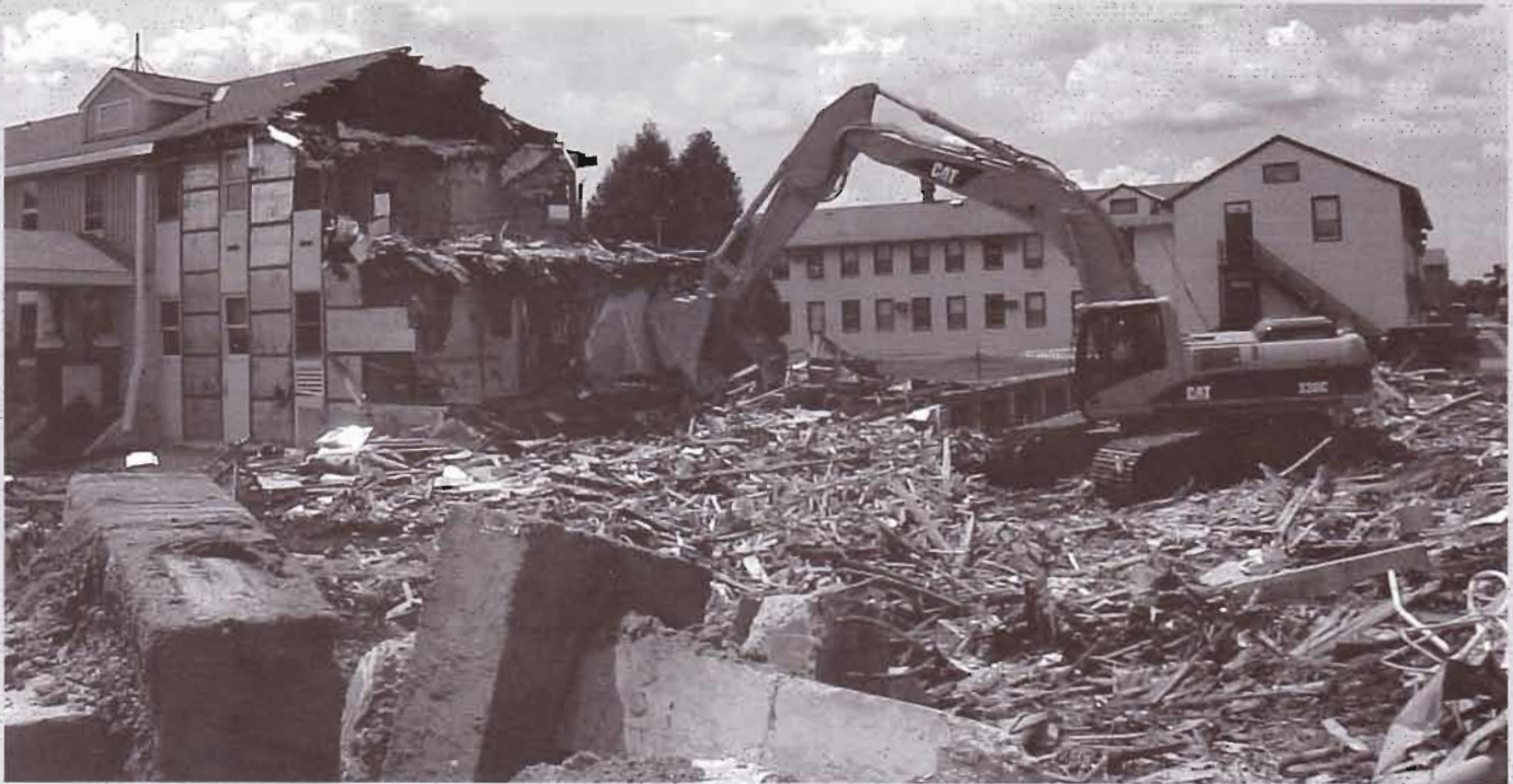
Building 716 demolition, June 2002. Several members of the unit's pavement and equipment shop used their annual tours for the demolition, which was necessary due to water damage.