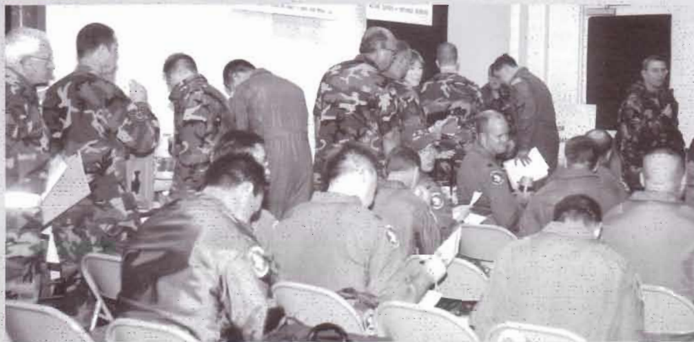
934th personnel go through the processing line