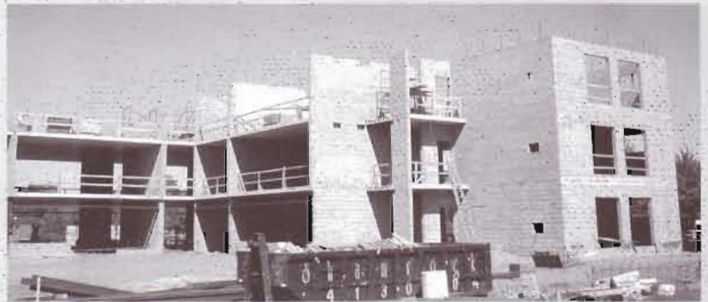
The new lodging opened its doors in February 2002