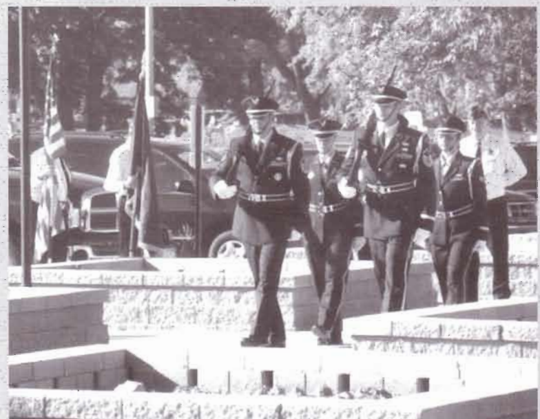
Honor Guard performed at Sept. 11 memorial.

of food in the receiving line, from kabobs to fajitas. The dining facility displayed excellent customer service and did an outstanding job of promoting morale among the troops.