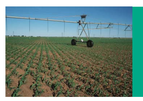
In an arid region like New Mexico the Ogallala Aquifer Initiative is helping producers conserve precious groundwater by implementing water conservation practices.

Since 2003, NRCS in New Mexico has helped agricultural producers save more than 4,000 acre-feet of water from the Ogallala Aquifer by voluntarily shutting down irrigation pumps for three years on contracted acres. NRCS provided incentive payments to producers to help offset foregone income for the three years the fields were not irrigated. In addition, some producers entered in to long term (10 year) contracts to include vegetative cover in their crop rotation, which also helped greatly reduce the amount of irrigation water being pumped. NRCS assisted producers with developing conservation plans to voluntarily implement additional water conservation practices. Through the Ogallala Aquifer Initiative, NRCS in New Mexico applied water saving conservation practices on 2,794 acres, saving approximately 340 acre-feet of water during 2011 alone.