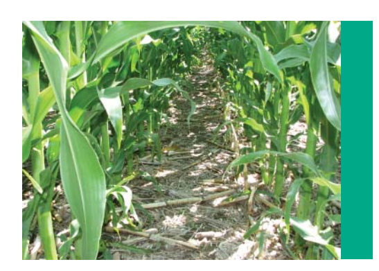
Converting cropland to dryland and notill has a significant impact on improving water quantity and quality, and also greatly reduces energy consumption.

In addition to reducing impacts on the Ogallala Aquifer levels, these producers are interested in the benefit they will see from cost-savings and reduced energy consumption. They will no longer use diesel or gasoline engines to pump water for irrigation, and they will use their tractor less since they are no longer tilling their fields.