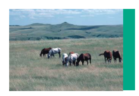
Providing a reliable water source for ranchland has resulted in improved water quality in the Ogallala Aquifer. This has also reduced the likelihood that rangeland would be converted to cropland, potentially placing more pressure on the Aquifer.

Even with less than three percent of the Ogallala Aquifer within South Dakota, conservation practices available through the Ogallala Aquifer Initiative will make an impact on water quality and quantity across the entire Aquifer.