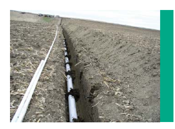
Switching from gravity irrigation to a sub-surface drip irrigation can reduce the amount of water applied to fields by one third.