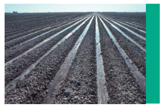
Producers in Kansas are using the Ogallala Aquifer Initiative to replace flood irrigation systems.

Harms will use the Ogallala Aquifer Initiative funding to install two center pivots replacing the current flood irrigation system on 245 acres. Harms's 5-year average water use on this land has been 222 acre-feet with flood irrigation. By switching to a center pivot irrigation system, Harms can expect to reduce the amount of water he's applying to his fields by an average of 30 percent.