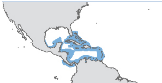
Distribution copied from Veron and Stafford-Smith (2002).