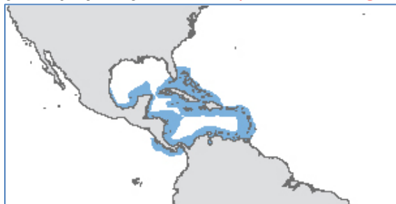
Distribution copied from Veron and Stafford-Smith (2002).