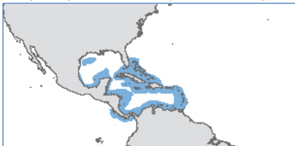
Distribution copied from Veron and Stafford-Smith (2002).