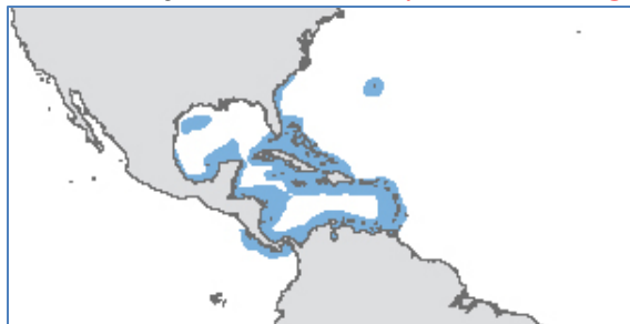
Distribution copied from Veron and Stafford-Smith (2002).