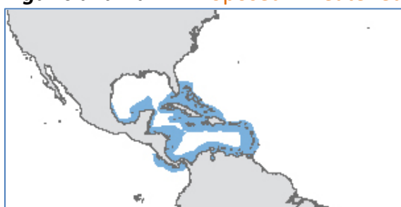
Distribution copied from Veron and Stafford-Smith (2002).