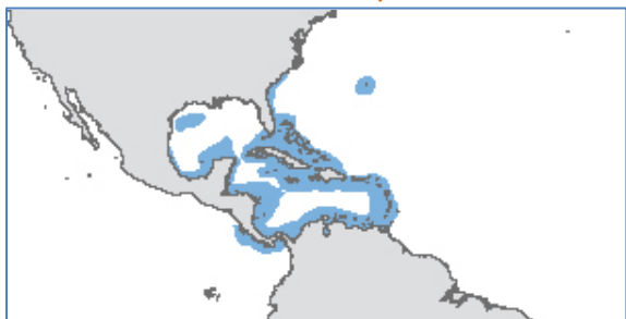
Distribution copied from Veron and Stafford-Smith (2002).