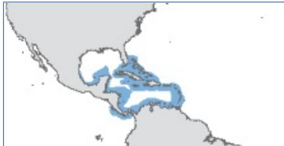
Distribution copied from Veron and Stafford-Smith (2002).