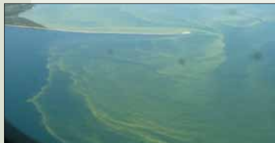
Aerial photo of Lake Erie blue-green algal bloom near Kelley's Island, Sept. 4, 2009.