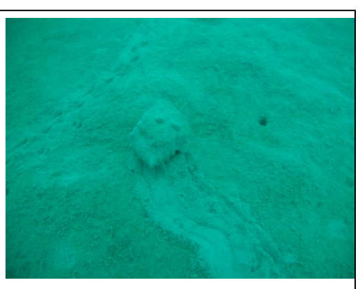
One of Several Fighting Conchs ( Strombus alatus ) Observed in the Survey Area