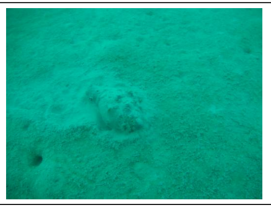
One of Several Fighting Conchs ( Strombus alatus ) Observed in the Survey Area