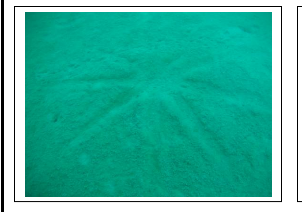
Evidence of Invertebrates – Likely Sea Stars (Asteroidea sp.)