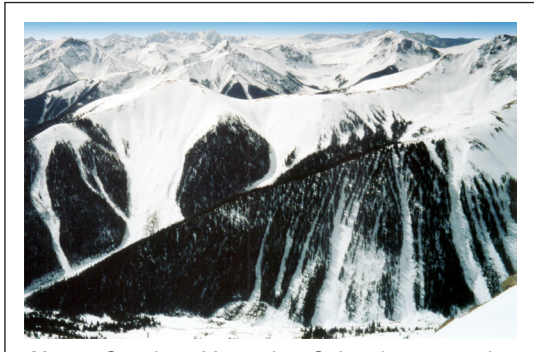
Above: San Juan Mountains, Colorado – a prominent contributor of snowmelt runoff to the Colorado River. Right: Snow Cover maps will be coordinated with mountain weather stations for integrated operational hydrologic forecasting.

Canopy-adjusted Snow Cover product will use ancillary information about the location of tree cover to adjust the Viewable Snow Cover to actual snow cover below the canopies. In open areas, the fractional snow cover will remain the same. Both of these products are critical to NOAA interests. The Viewable Snow Cover gives the exposure of snow cover to the atmosphere and as such provides critical information for weather forecasting and climate analysis. The Tree Canopy-adjusted Snow Cover gives operational water managers more accurate working knowledge of complete snow cover and the regions of contributing snowmelt.